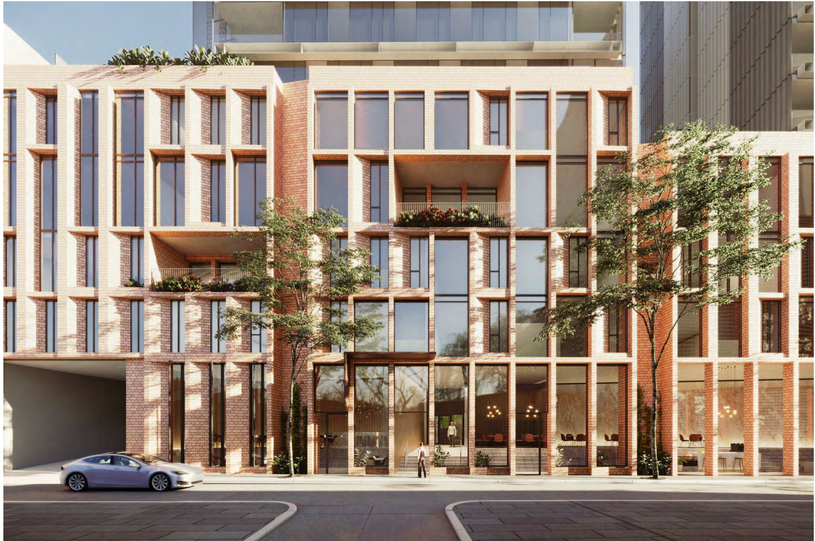
3D RENDER PHOTOMONTAGE FROM BUCKHURST LN & TATES PLACE INTERSECTION - WITH NO CURRENT EXISTING ADJACENT BUILDINGS MASSING