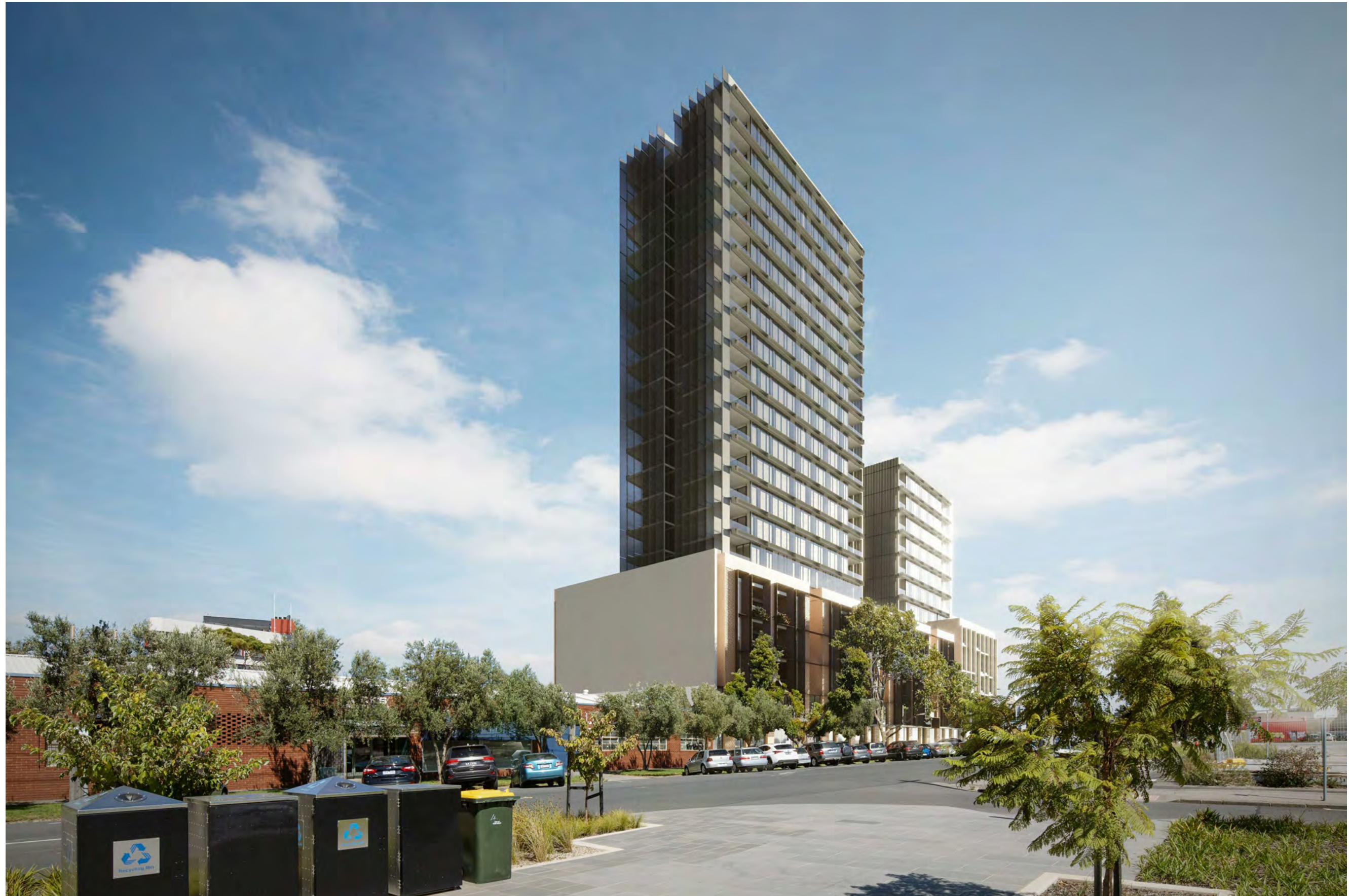
3D RENDER PHOTOMONTAGE FROM KIRRIIP PARK - WITH CURRENT EXISTING ADJACENT BUILDINGS