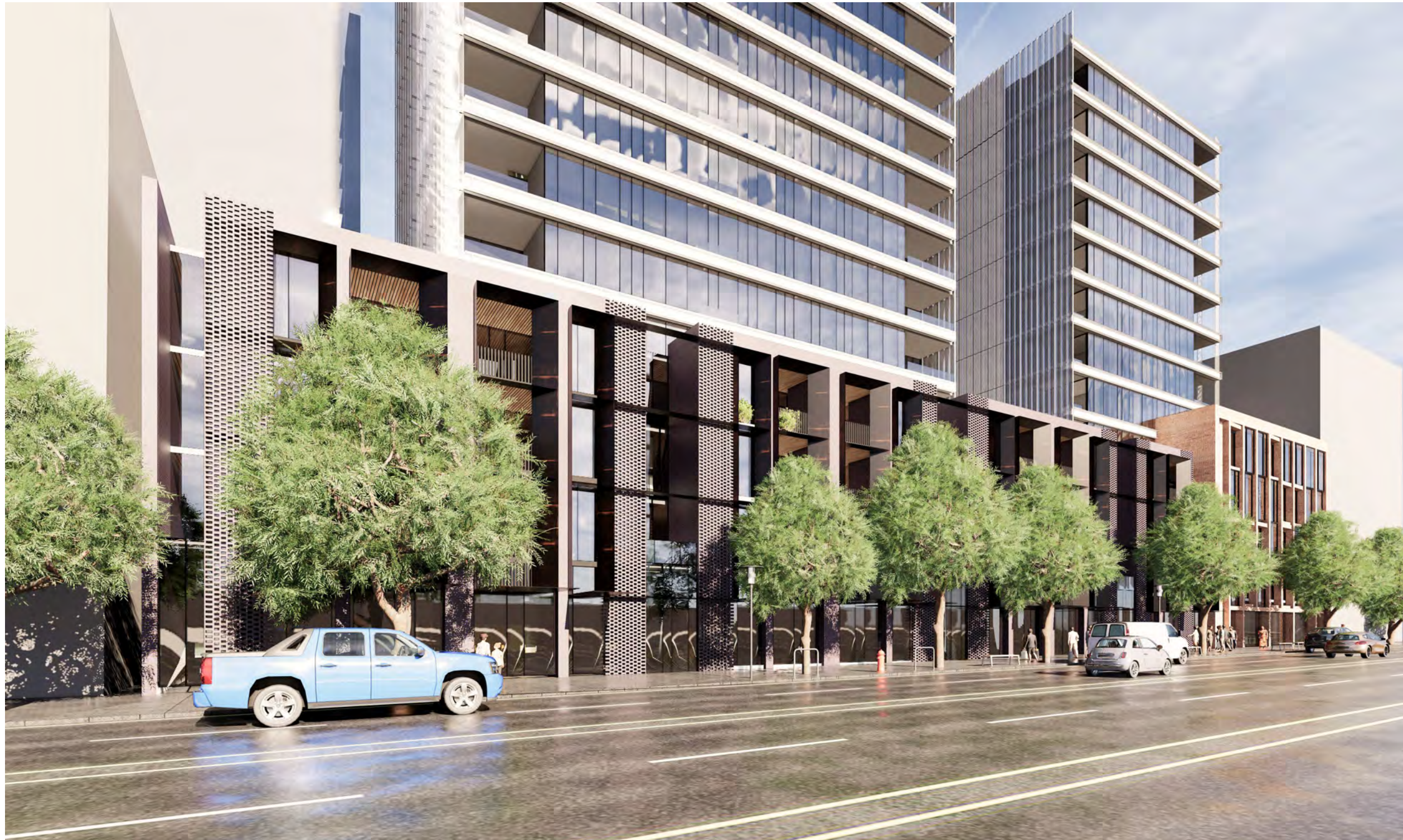
PERSPECTIVE VIEW OF BUCKHURST STREET FROM EASTERN END