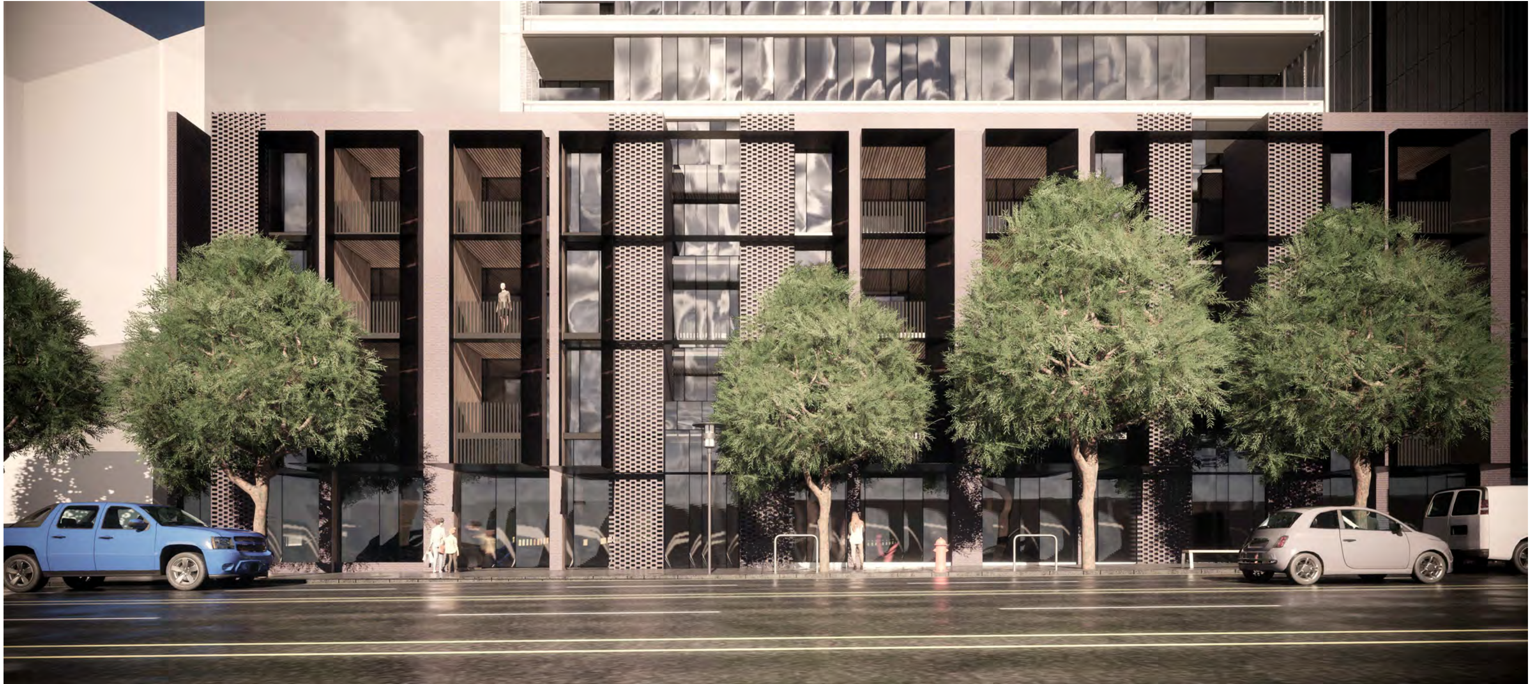
ELEVATION VIEW OF BUCKHURST STREET