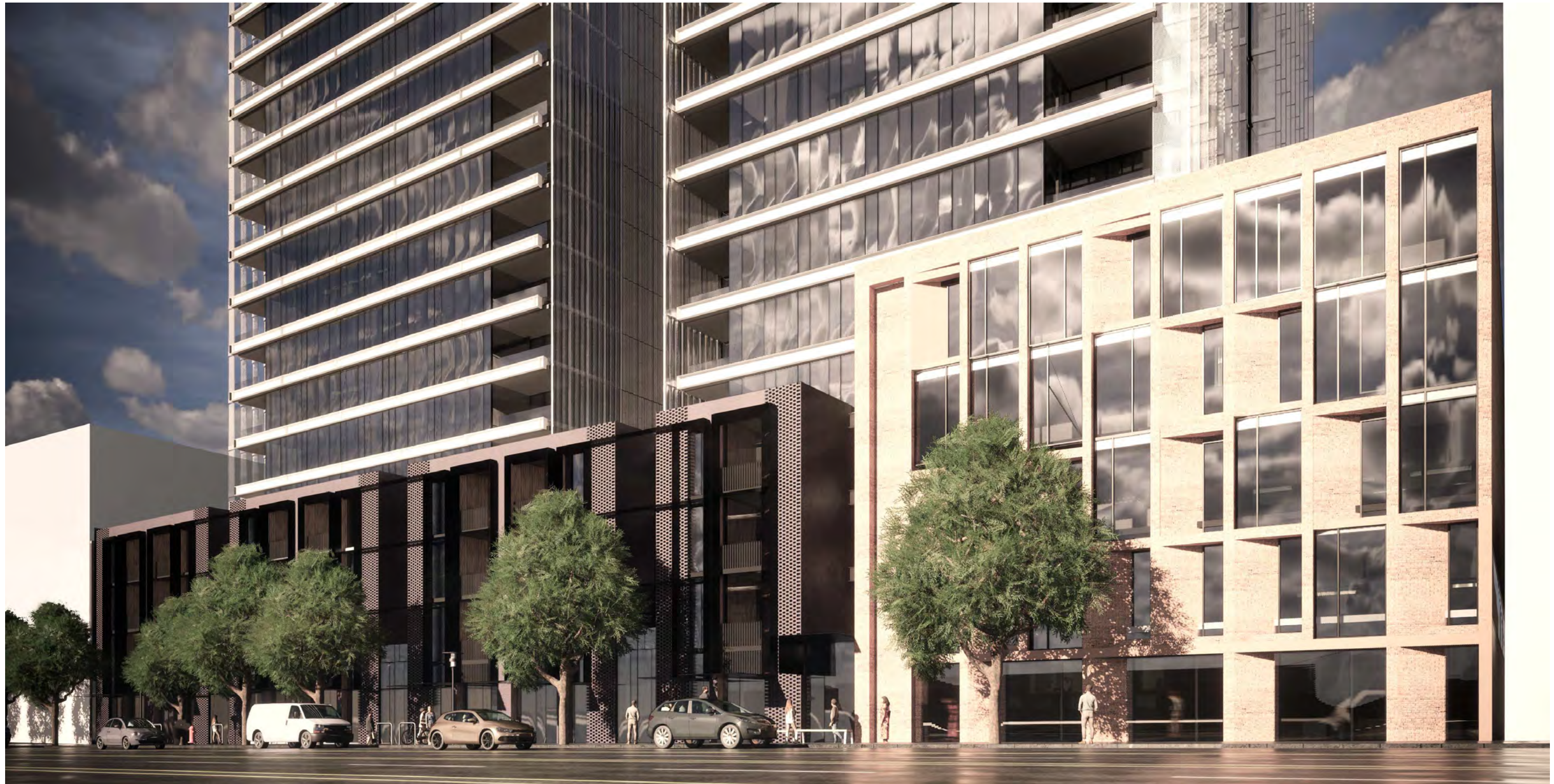
PERSPECTIVE VIEW OF BUCKHURST STREET FROM WESTERN END