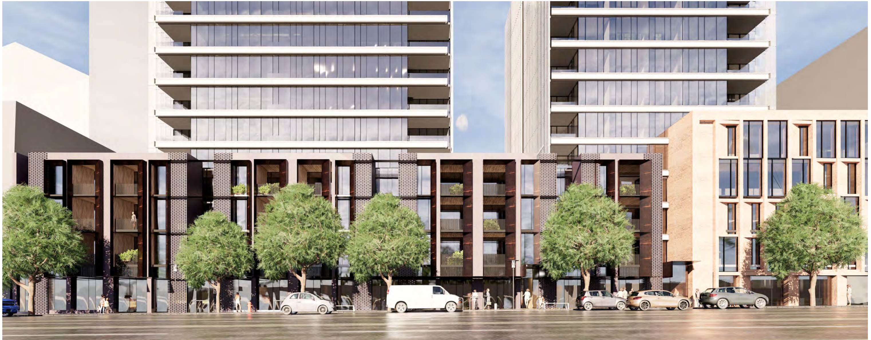
ELEVATION VIEW OF BUCKHURST STREET