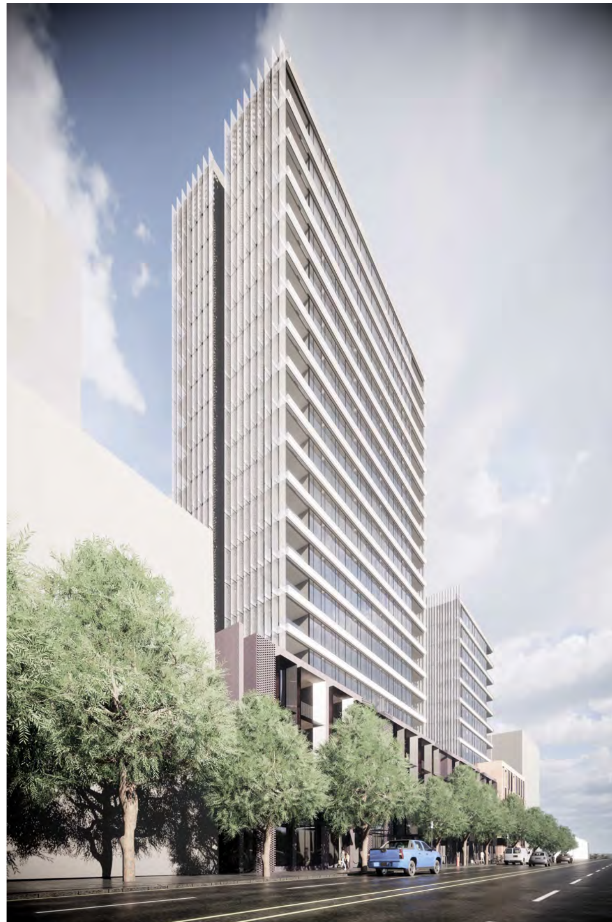
PERSPECTIVE VIEW OF BUCKHURST STREET FROM EASTERN END