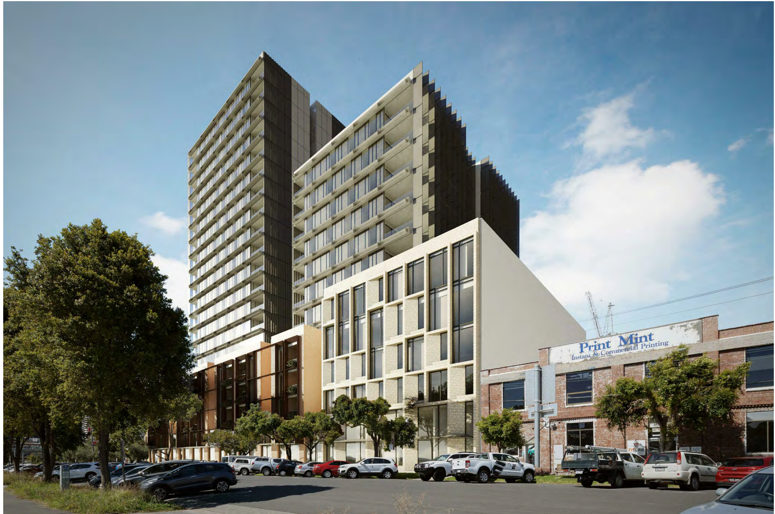
3D RENDER PHOTOMONTAGE FROM GEORGE ST & BUCKHURST ST INTERSECTION - WITH CURRENT EXISTING ADJACENT BUILDINGS MASSING