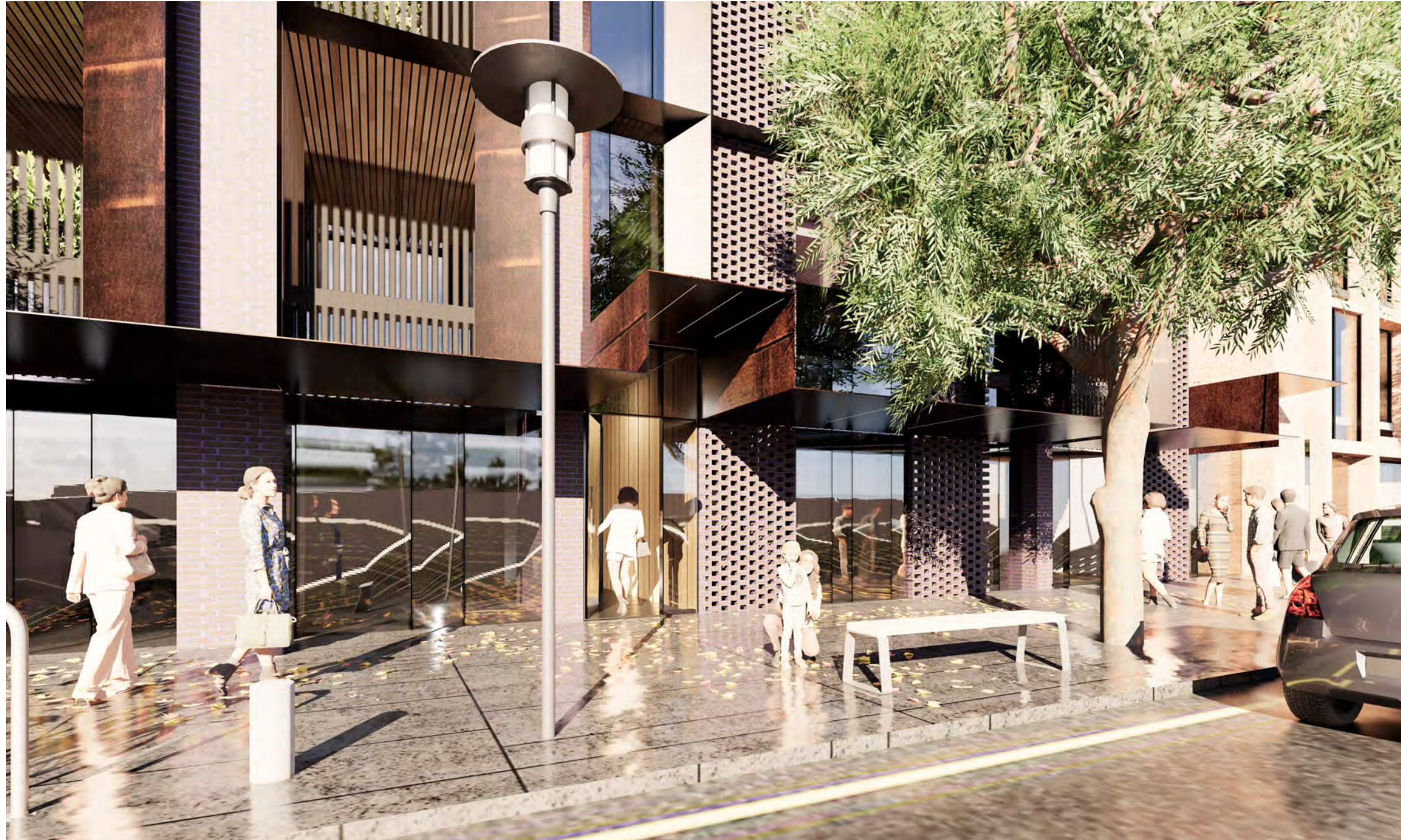
RESIDENTIAL ENTRY ON BUCKHURST STREET