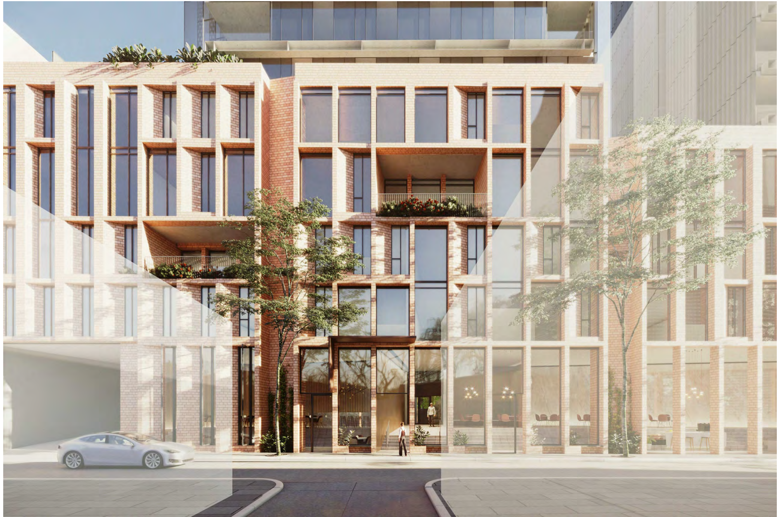
3D RENDER PHOTOMONTAGE FROM BUCKHURST LN & TATES PLACE INTERSECTION - WITH CURRENT EXISTING ADJACENT BUILDINGS MASSING