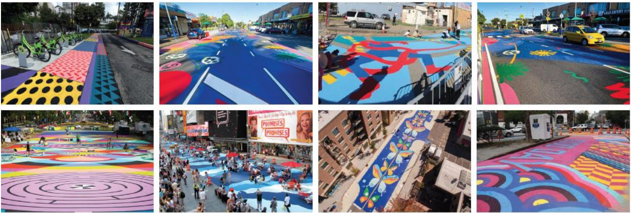
Free-painted lines, filled in with block colour