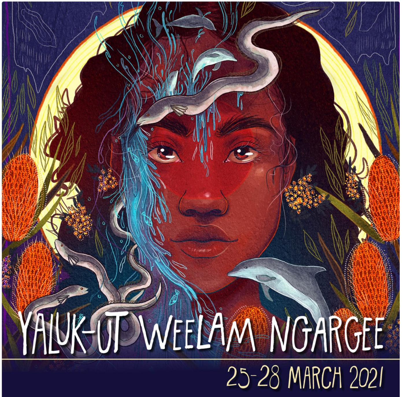
Yaluk-ut Weelam Ngargee Festival 2021