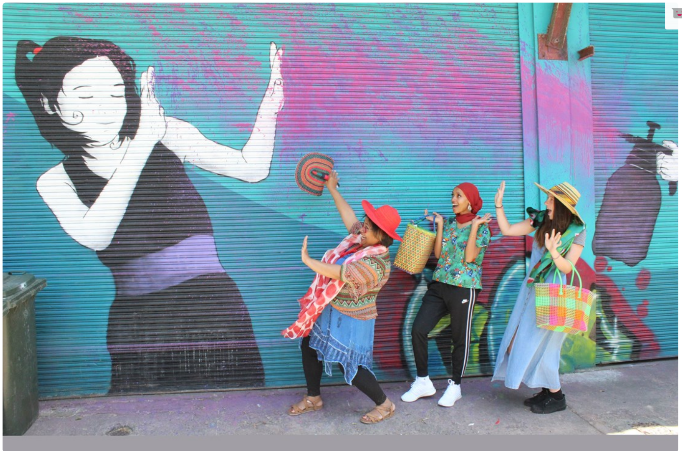
Space 2B Laneway Festival

We want to help you create events that celebrate our City's community spirit, identity, arts and culture. Not-for-profit orgs and community groups are invited to apply for our Local Festivals Fund Recovery grants up to $10,000 to develop small to medium-scale local neighbourhood festivals or events.