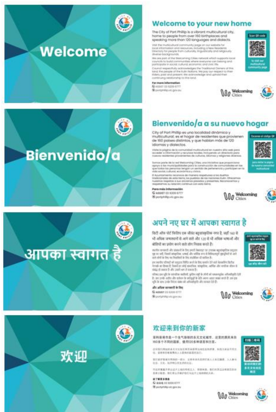
Figure 2 Welcome to City of Port Phillip postcards in different languages, a MAC initiative as part of Cultural Diversity Week 2023.

The City of Port Phillip Multicultural Advisory Committee (MAC) respectfully acknowledges the Traditional Owners of this land, the people of the Kulin Nations. We pay our respect to their Elders, past and present. We acknowledge and uphold their continuing relationship to this land.