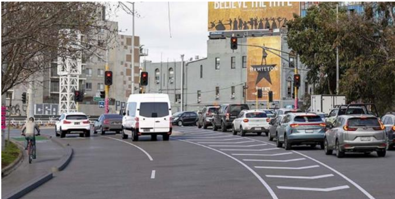
St Kilda Road bike corridor

As we continue to grow, an integrated transport experience will create a City where community is active, connected, and safe.