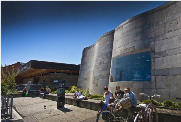
St Kilda Library

Our libraries play a vital and valued role in shaping the cultural and social character of our City. The St Kilda Library redevelopment will meet the growing and changing needs of Port Phillip residents providing an increased and enhanced hub for creativity, knowledge, and connectivity.