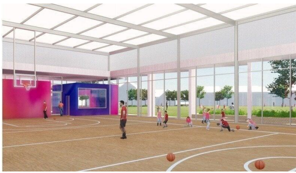
Artist impression of the proposed St Kilda Primary School recreation space.

St Kilda Primary School has been serving our community for 150 years, and is a much-loved part of our municipality, fostering community spirit and togetherness. To support its 430 students and the broader community, the school is seeking to establish an indoor, multi-purpose recreation space for sport, leisure, and social activities.