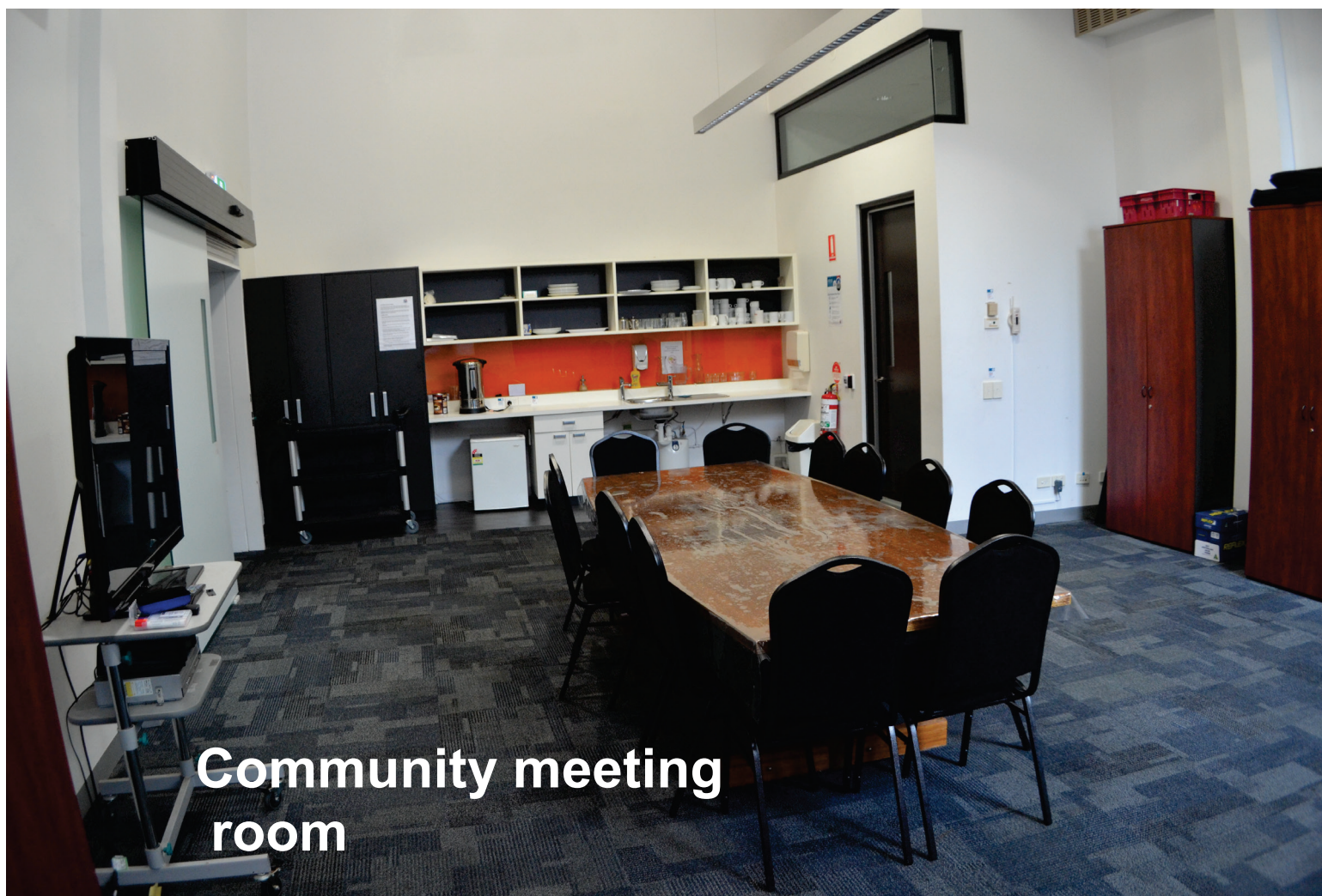
Community meeting room