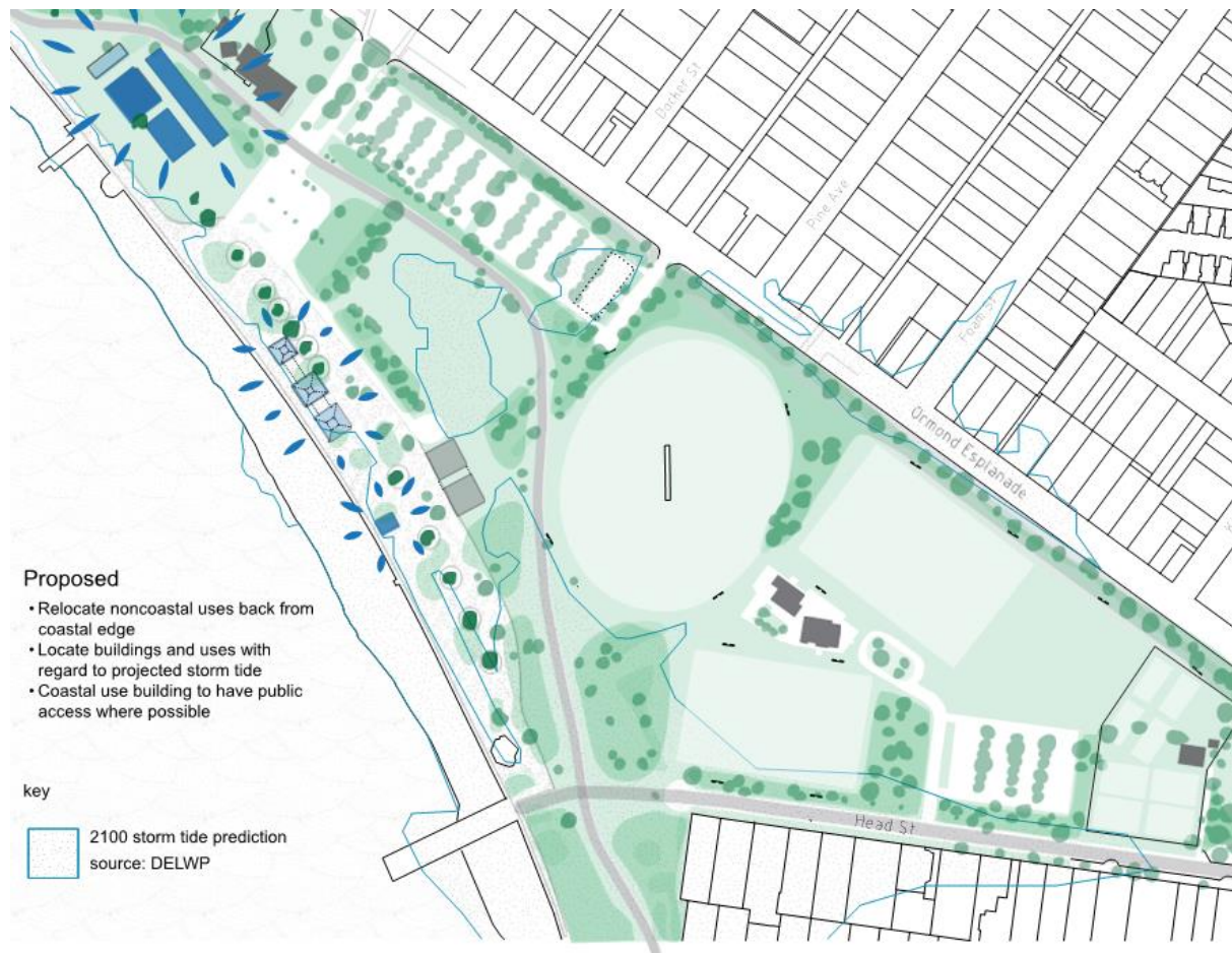
Figure 2 Storm tide prediction excerpt

The current draft Masterplan by NMBW includes a DELWP 2100 prediction of storm tide and this is shown in the Figure below (extracted from draft Masterplan).