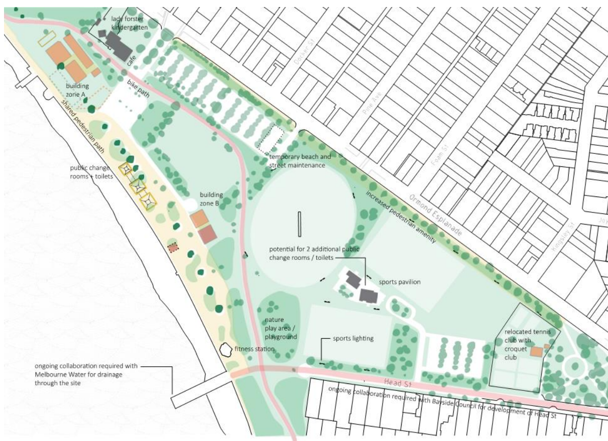
Figure 1 Draft masterplan excerpt

More recently Storm was provide the draft Masterplan dated May 2021 from NMBW that is assumed to reflect the latest proposal.