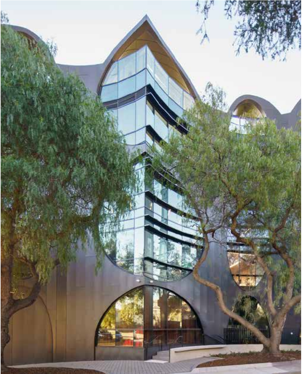
Victorian Pride Centre

BAU GAA (Brearley Architects & Urbanists and GrantAmon Architects)