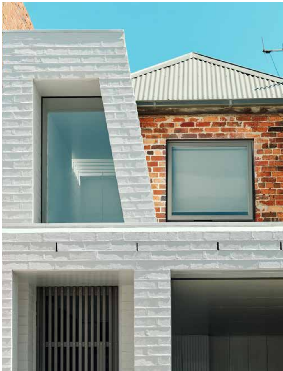
Albert Park Lantern House