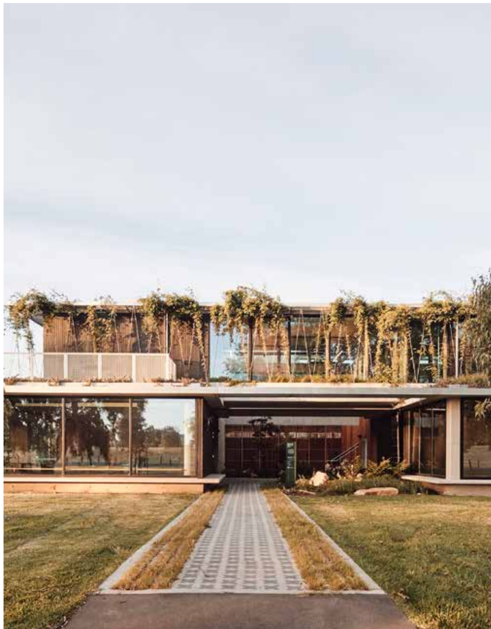
Parks Victoria, Albert Park Office and Depot