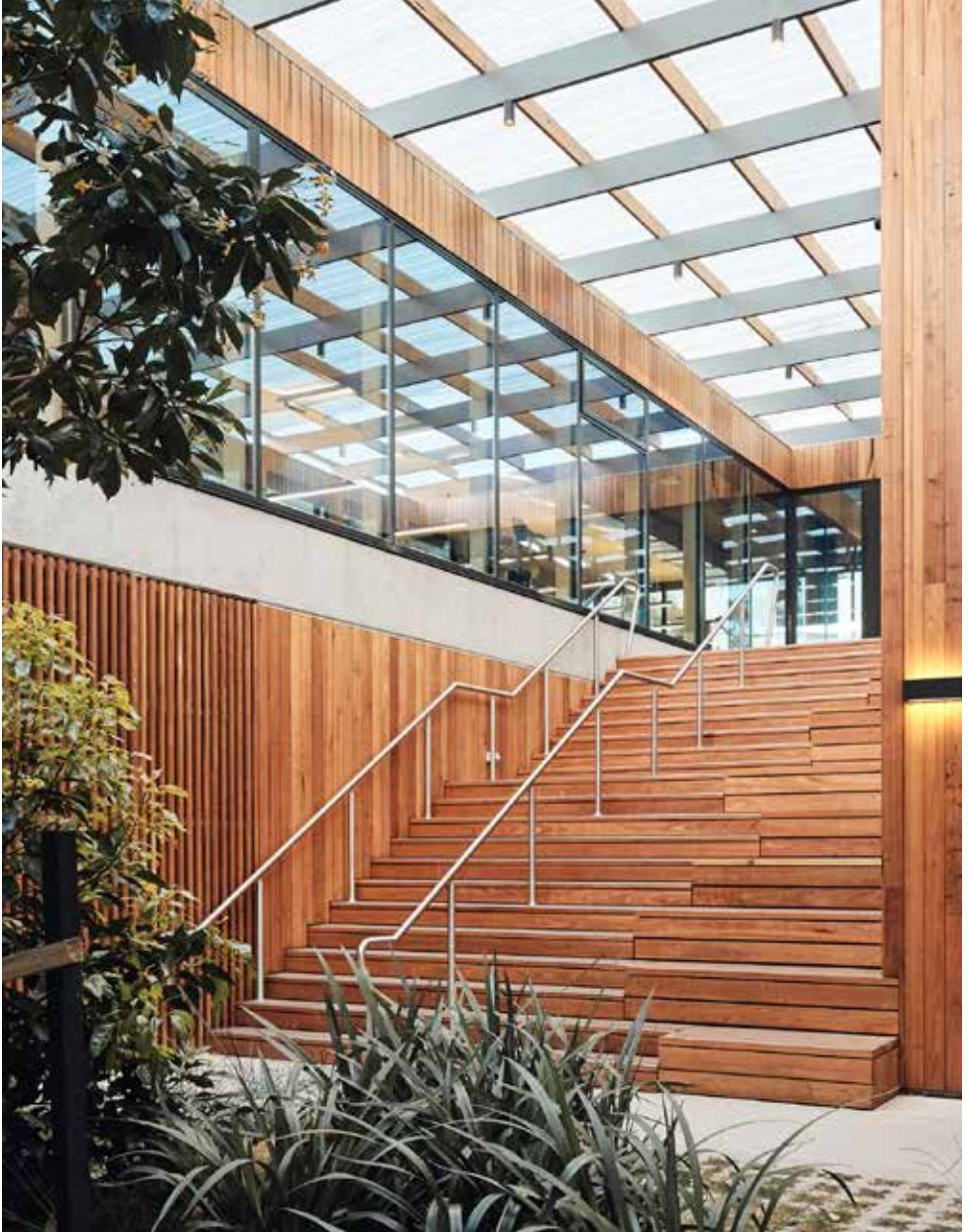
Parks Victoria, Albert Park Office and Depot