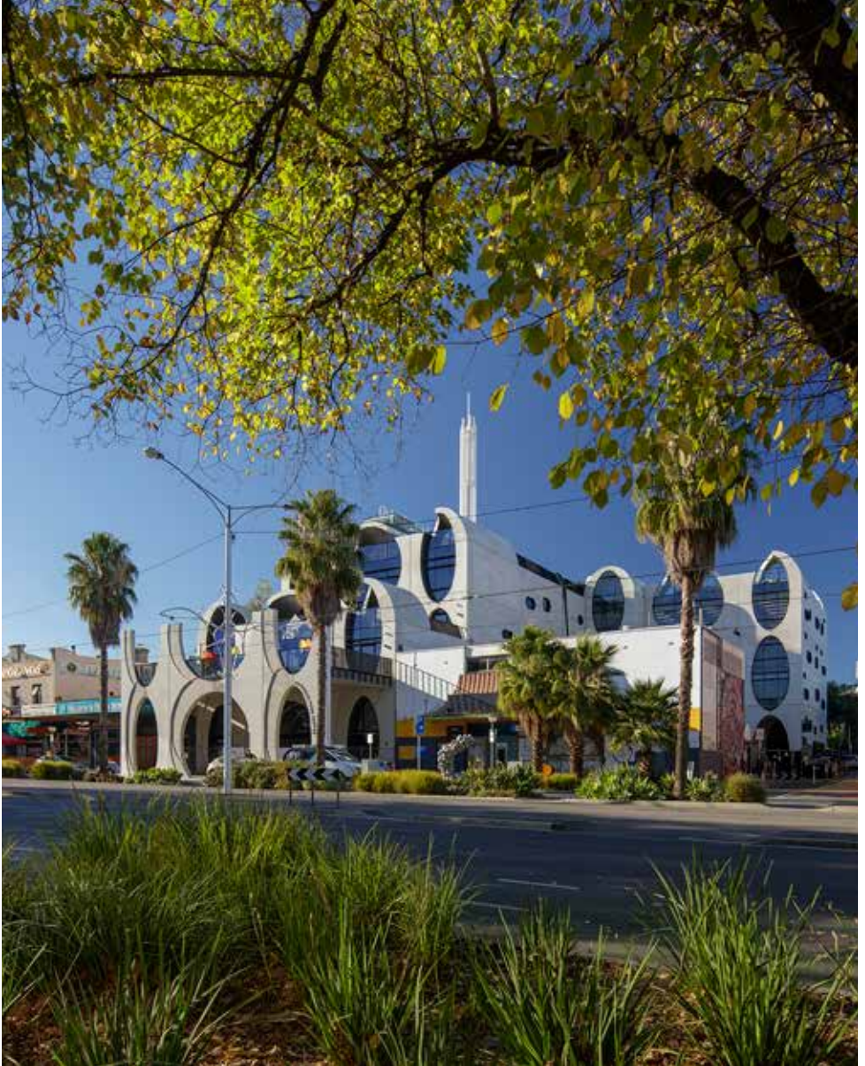
Victorian Pride Centre

BAU GAA (Brearley Architects & Urbanists and GrantAmon Architects)