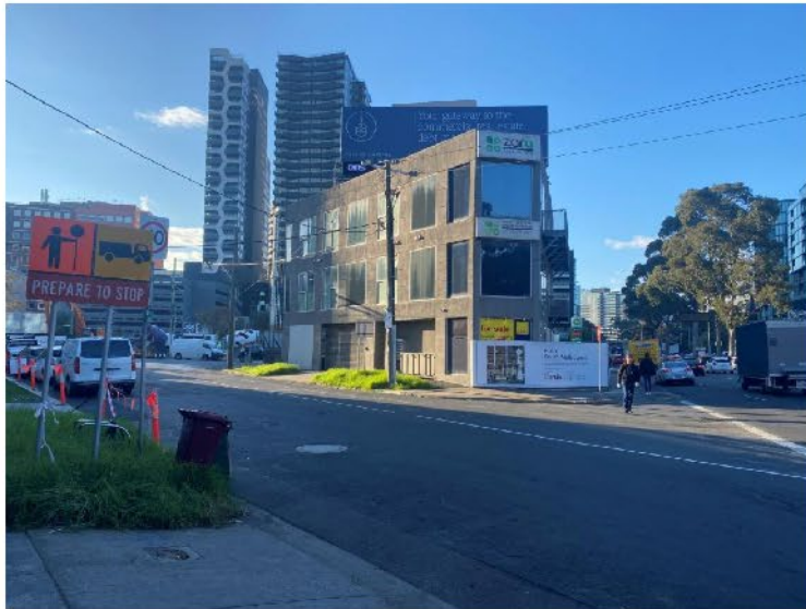
Photograph 4: Looking east across Kings Place to the subject site