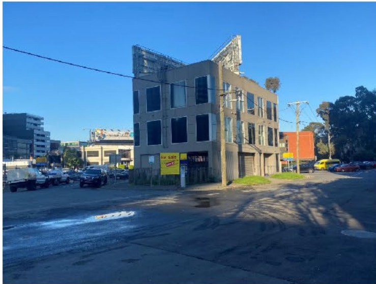
Photograph 6: Looking west from the junction of Cobden Street and Kings Place towards the subject site