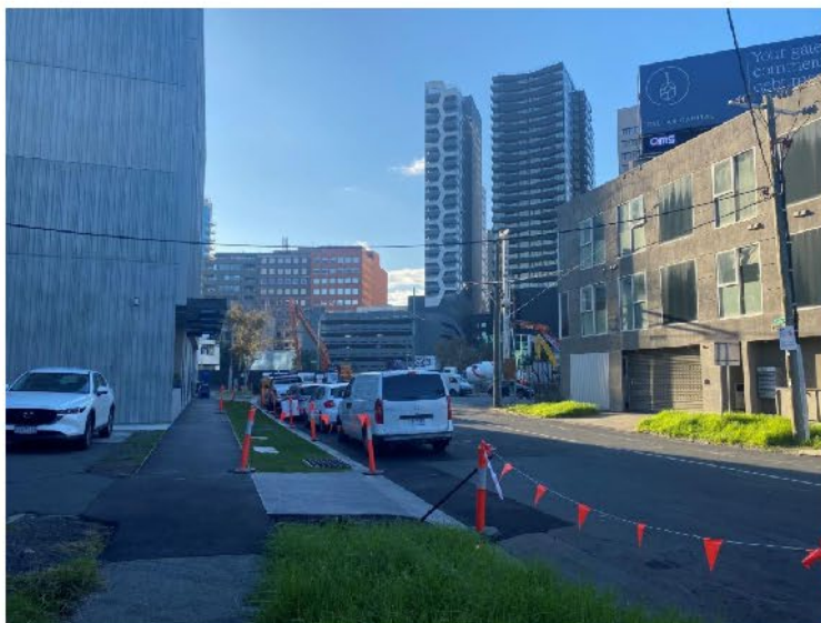
Photograph 5: Looking north-east along Kings Place with Towers fronting Albert Road in the background