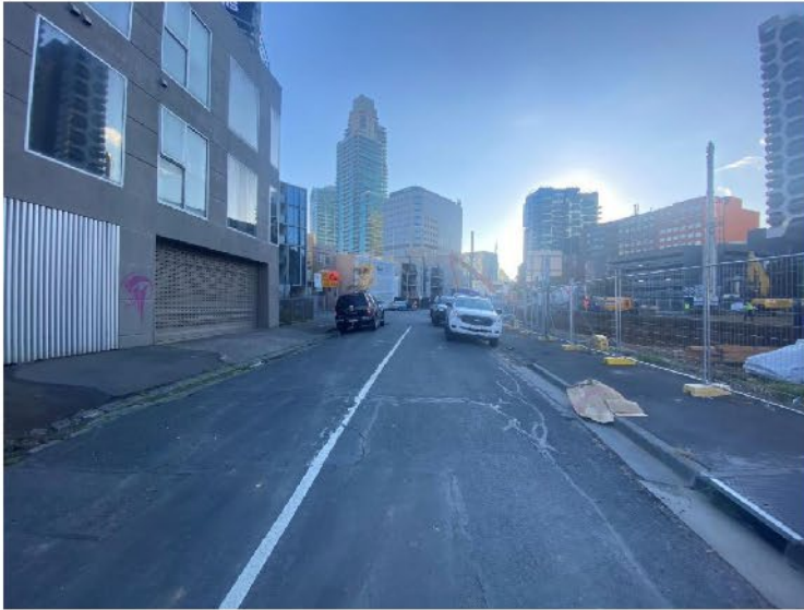
Photograph 2: View looking north along Cobden Street