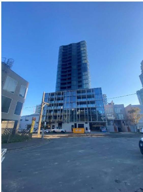
Photograph 7: Looking north across Kings Place towards the rear of 37 and 39-43 Park Street (20 storeys (62.22 m AHD)+ plant (66.10 m AHD))