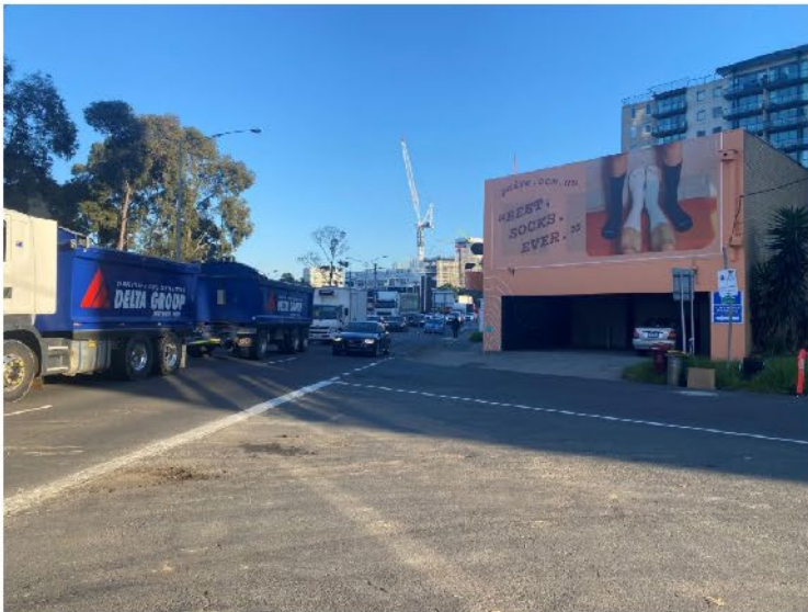
Photograph 3: Looking north-west from the junction of Kings Way and Kings Place