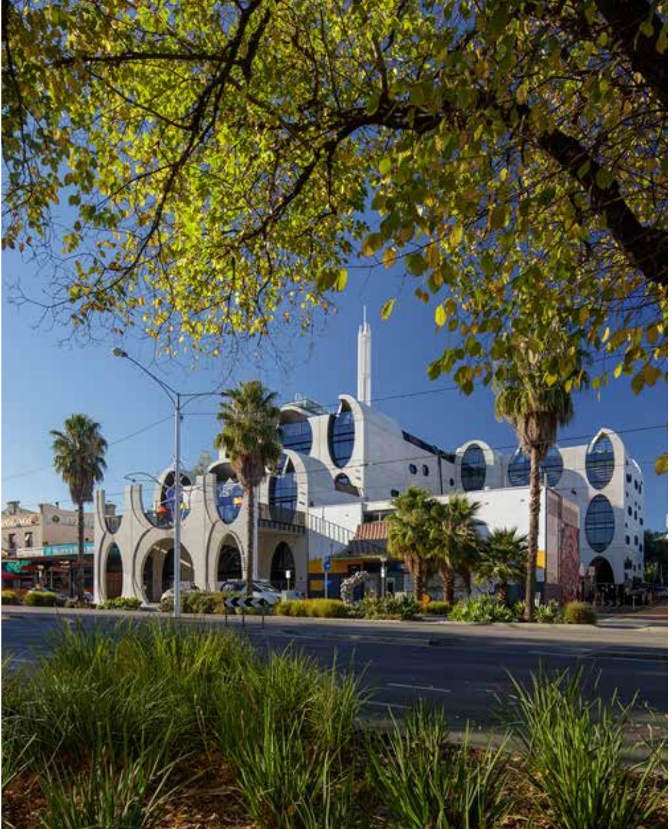
Victorian Pride Centre

BAU GAA (Brearley Architects & Urbanists and GrantAmon Architects)