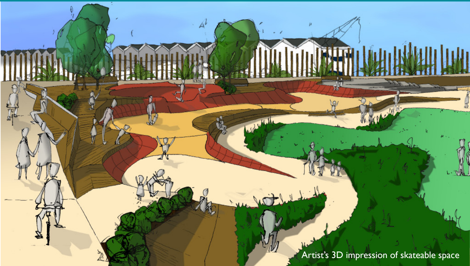
Artist's 3D impression of skateable space