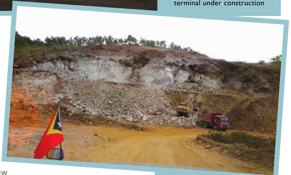
Roadworks of 156 kms underway in Covalima

making the earth bricks used in the construction. There is some discontent with house sizes not being of equal value or land size equal to that forfeited. There is less land for agriculture, chicken raising or much garden. Land prices have now risen in Covalima.