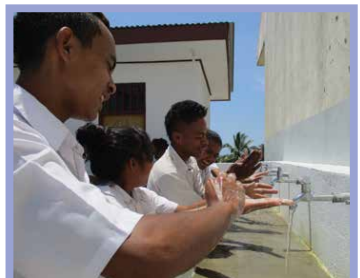
Health and Hygiene training with the new water supply to the school