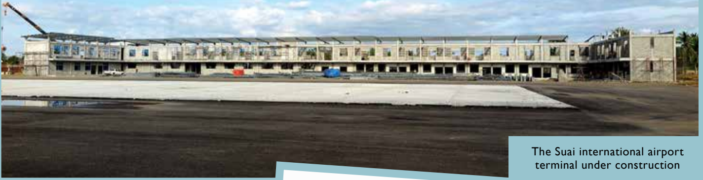
The Suai international airport terminal under construction

Covalima district is located in the southern-western part of the country and borders Indonesia to the west. It has an area of 1.226 sq. km with a population of 64, 500. On the outskirts of town, major road works are underway on the Suai-Beco road and will connect future industrial clusters on the south coast of Timor-Leste and will have significant benefits for the Timor-Leste petroleum industry.