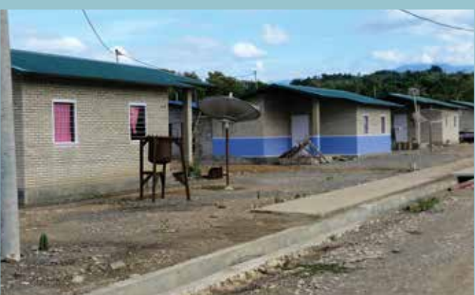
Community Housing Ltd a good model of development which employed local labour from the village to be relocated to build the first twenty five houses with more to come.

By contrast, the nearby housing development for those who had to move, is a local enterprise training 200 local village people constructing the housing,