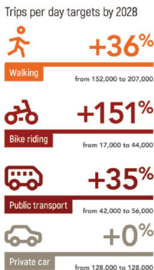
Figure 1: Mode share targets from Move, Connect Live: Integrated Transport Strategy

In 2018, Council adopted the Move, Connect Live: Integrated Transport Strategy 2018-28 (the Strategy) to address the challenges facing Port Phillip from a transport and liveability perspective, particularly as the population in and around the municipality grows. This strategy also sets a clear target for minimising car trips by providing real transport choices for residents, employees and visitors as outlined in Figure 1 below.