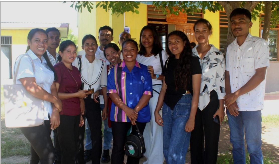
Graduates from the Friends of Suai scholarship program came to Suai to meet with the study tour participants in June.

Chair, Friends of Suai /Covalima Community Reference Committee