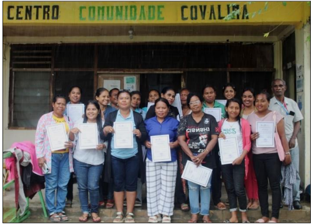
Fifteen women completed computer literacy training at the CCC in July, using computers donated from Council.