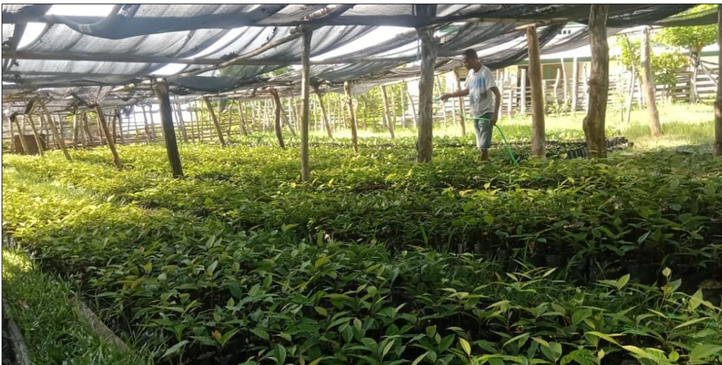
Thousands of trees have been grown in the nursery in Lalawa since 2019.

There are plans to establish a national Rai Matak Foundation later in 2024, which has the principle aim to continue to work with local communities throughout Timor-Leste to carry out carbon farming using the successful WoS model.