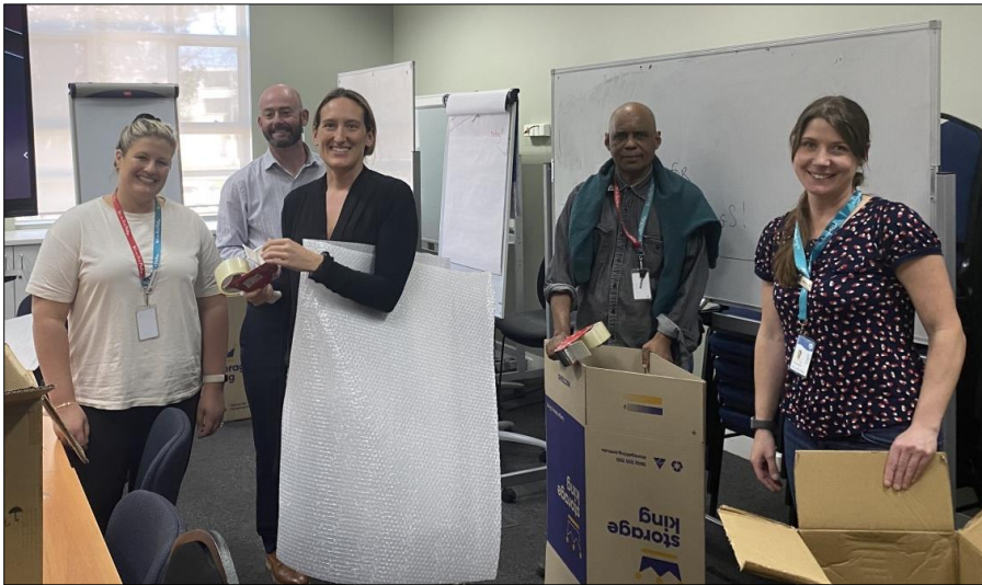
Council staff from across the organisation donated their time to pack computer equipment to ship to the CCC.

Council staff were also offered the opportunity to support the friendship by assisting at the annual trivia night in April. Two staff volunteered their time and did a fantastic job to help the event run smoothly and ensure people enjoyed the evening.