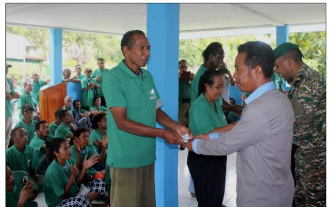
Photos: (above) Approx. 28,000 trees were distributed and planted in May; (Right) Annual payments to farmers bring much needed income into rural communities in Tilomar sub-district.