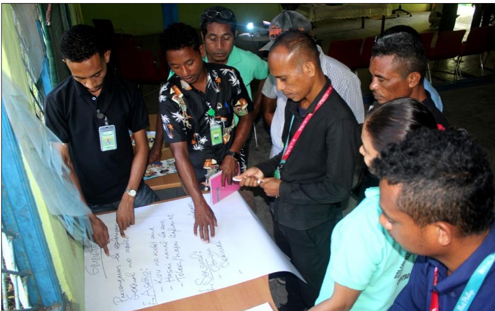
Photo: CCC staff members participating in child protection refresher training.

The Friends of Suai Coordinator has supported the CCC Director to develop new policies and write grant proposals. Friends of Suai Committee members have also provided training and mentoring to staff on topics including reporting, staff management and succession planning.