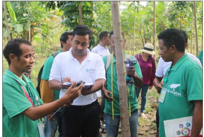
Auditors visited in July 2023 as part of the accreditation process for Gold Standard certification.

The WoS project in Tilomar is well underway with the process to gain accreditation for Gold Standard certification, with auditors visiting in July to verify the trees and meet with the community. Accreditation is a rigorous process with many requirements, which so far have been met. Once accredited, the carbon stored in the trees can be sold on the international carbon market. The income this will generate will ensure the sustainability of the project into the future. The social, economic and environmental impacts of this initiative have been lifechanging for the communities involved and the CCC team is proud to be involved.