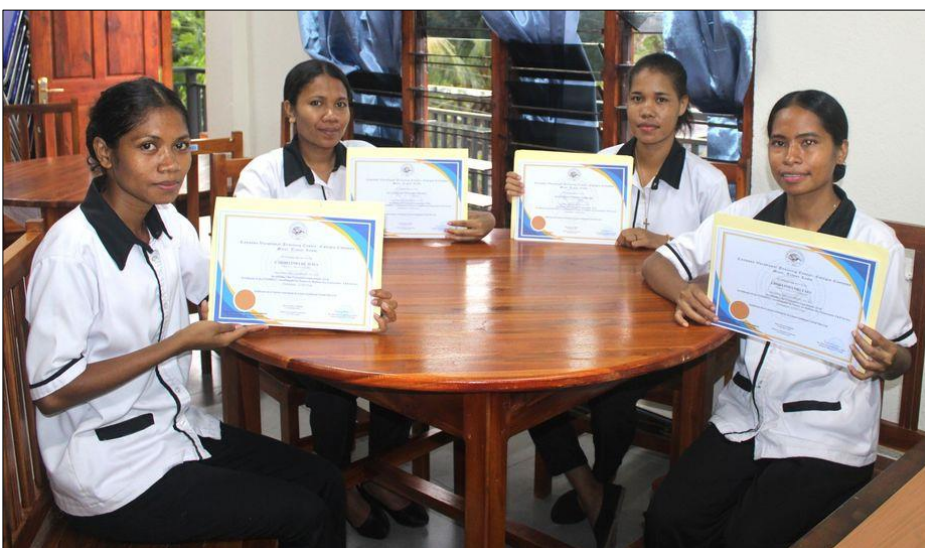
Four students graduated from Canossian Vocational Training Centre in Suai after completing a Certificate 2 in Hospitality.

Friends of Suai continues to support students at the National University in Dili to complete their post-graduate studies. Three Community Development students are underway and making progress with their post-grad studies. It is a long process, but they are motivated and doing well.