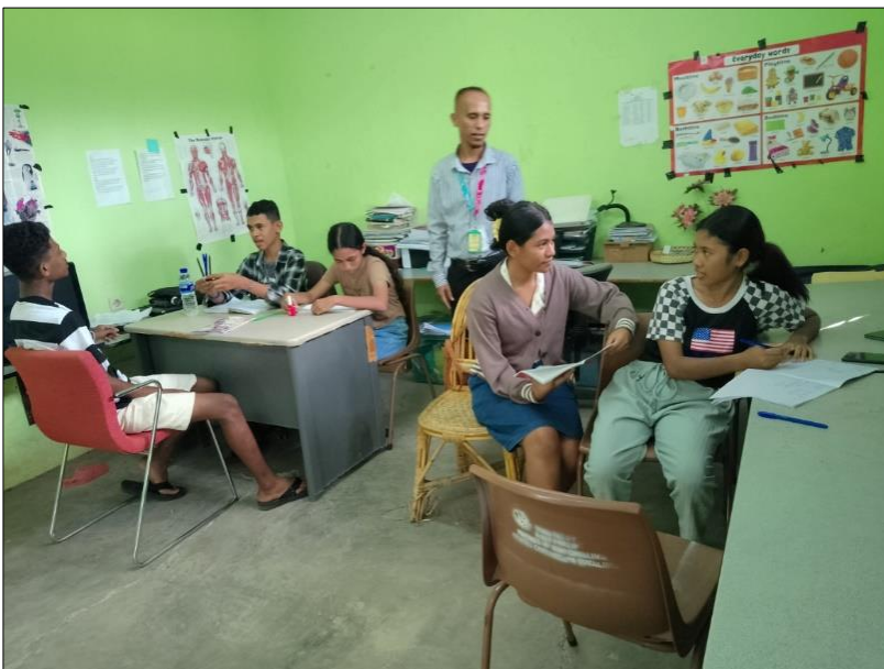
Photo: Many young people complete English language training at the CCC.

communities. As well as gaining practical skills, they are building relationships and developing their confidence. There is great demand from more women also wanting to participate.