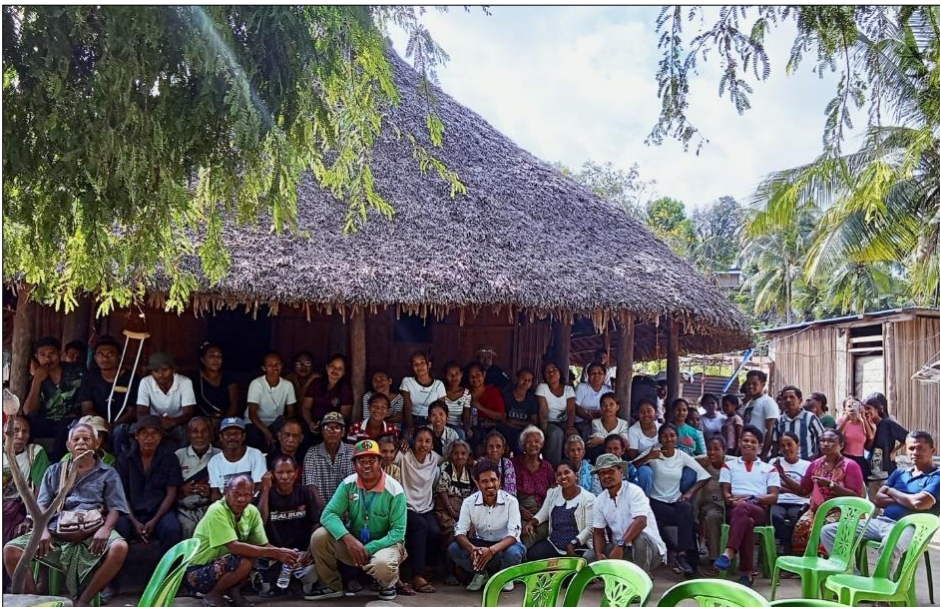
Communities throughout Covalima participate in gender equality and inclusion training programs.

The CCC is now nationally renowned for their work to support women's leadership, gender equality and raise awareness about gender-based violence. Their work is having a profound impact on the everyday lives of women and children, including people with disabilities, as they build the confidence and capacity to advocate for their rights.