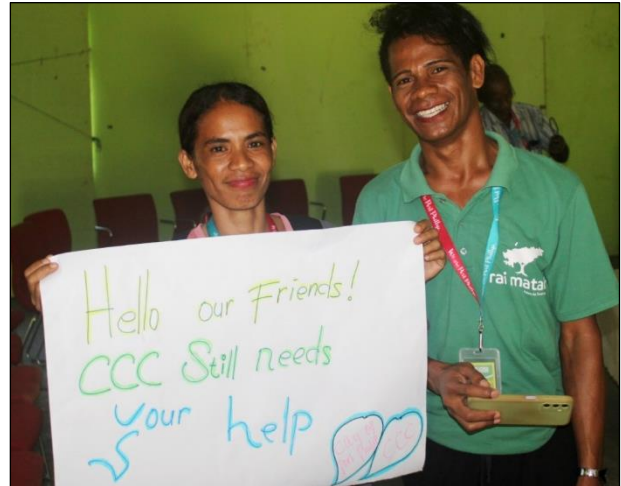
Photos: (Left) The annual trivia night includes a silent auction with many donated goods and services; (Right) Staff at the CCC with a message to share at the annual trivia night.