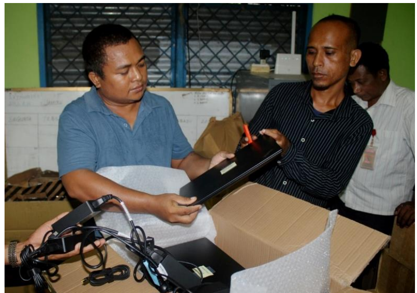
Staff at the CCC opening boxes of computer equipment donated from City of Port Phillip.

The City of Port Phillip provides in-kind support for the friendship by donating computers that would otherwise be disposed of when upgrading equipment. The equipment is shipped to the IT Social Enterprise at the CCC in Suai where it is used to deliver community training programs or sold to the community at affordable rates.