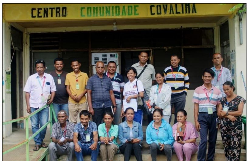
Members of the CCC Commission and staff after a quarterly meeting.

The CCC is a registered NGO and training organisation and has partnerships with local and international NGOs to implement a range of programs. The CCC manages initiatives funded through community donations and fundraising by Friends of Suai, and also has internal income-generating activities including community training programs and hiring of facilities.