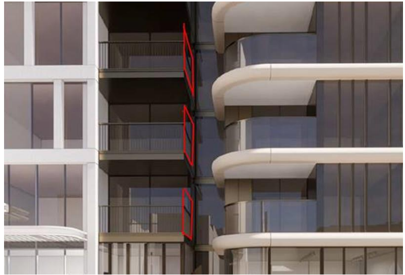
Suggested location of balcony privacy screens annotated in red.

The overall change to the design of the building