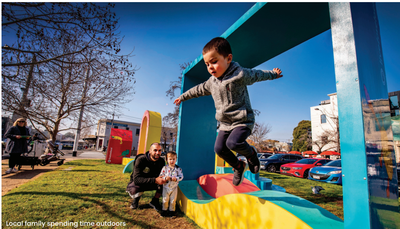
Local family spending time outdoors

You may have read lately that we're improving our technology and your experience through our new Customer Experience Program . This will mean faster, simpler and better systems