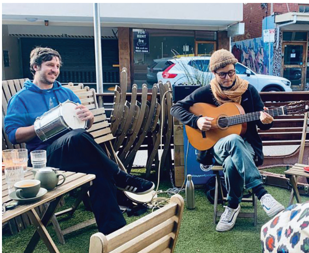
Local Musician playing drum and acoustic guitar

initiatives to support local musicians and music venues impacted by lockdowns.