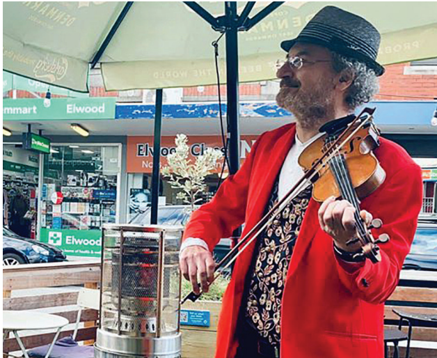
Local Musician playing violin