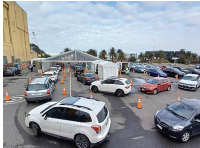
Covid testing at the Palais Theatre

This included a testing site outside the St Kilda Town Hall to respond to the East St Kilda outbreak, with testing staff having strictly controlled access to one set of dedicated toilets in the hall only. We've also had drive-through and walk-up testing on the Triangle site next to the Palais Theatre, a walk-up vaccination site at Peanut Farm Reserve, and smaller pop-up testing sites at each end of Grey Street. Finally, there's been mobile testing in car parks near Acland Street and Fitzroy Street to make it easier for traders to be tested, and testing of clients and staff at the Grey Street support services attended by a person who was a known positive case.