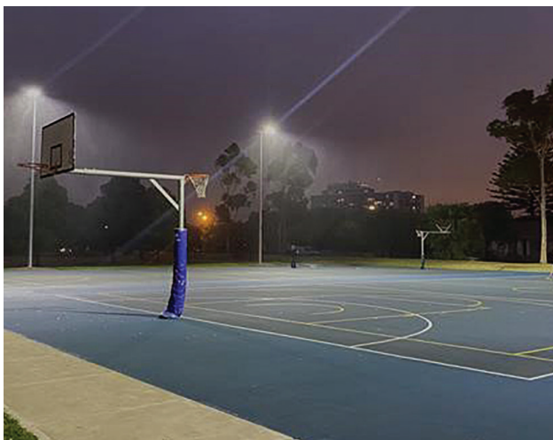
RF Julier Reserve netball court lighting

We hope that this trial of the bins is successful and well received, with ongoing costs becoming part of BAU.