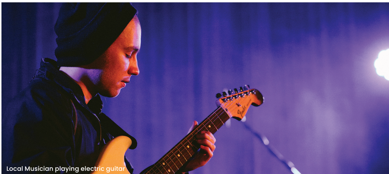
Local Musician playing electric guitar

We launched the updated Live Music Action Plan 2021–2024 in August, with a range of