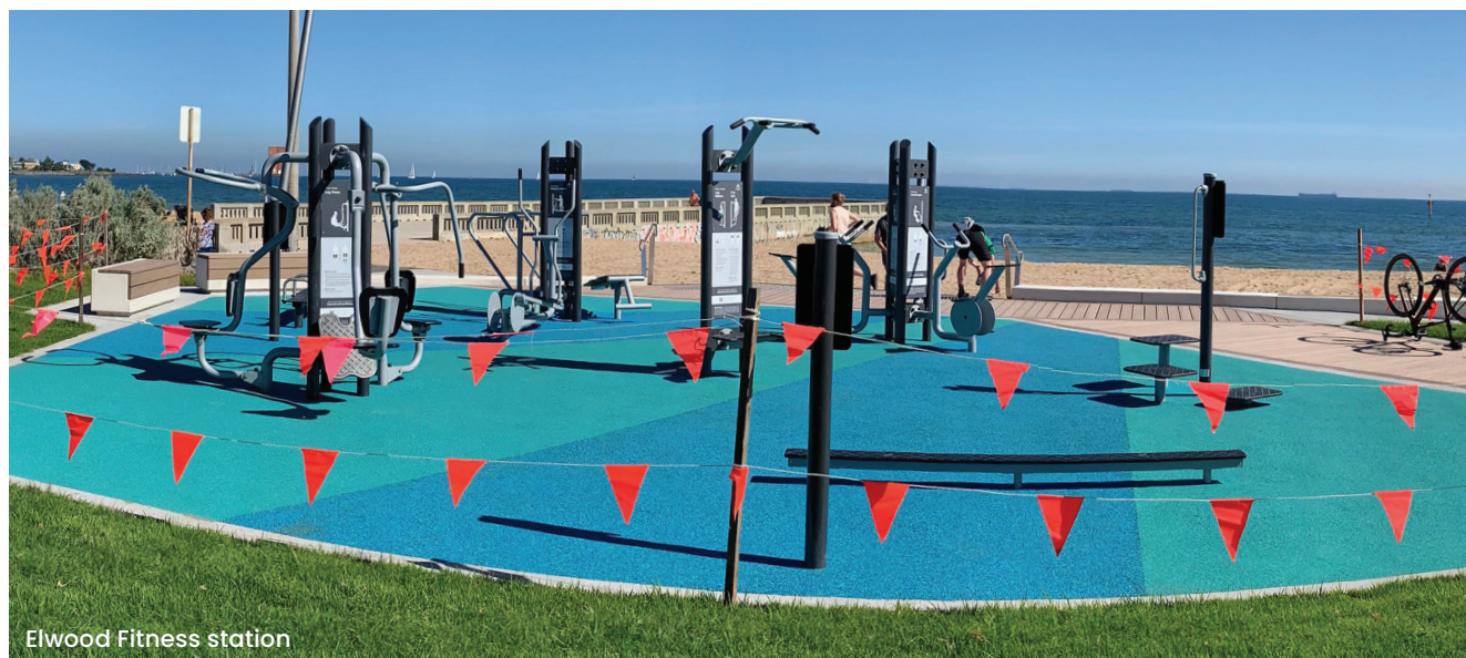
Elwood Fitness station

The lights will also be angled to achieve the minimum 100 lux lighting average across the