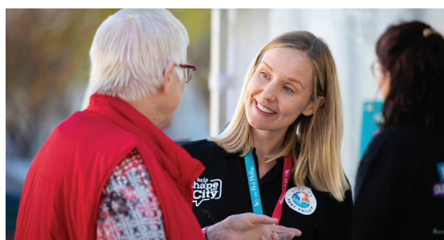
Neighbourhood Engagement Program

Feedback received will be presented to Council prior to final documents being considered for adoption.