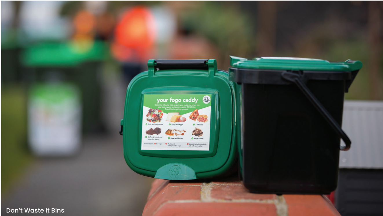
Don't Waste It Bins