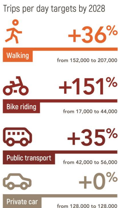
Figure 1: Mode share targets from Move, Connect Live: Integrated Transport Strategy

In 2018, our Council adopted the Move, Connect Live: Integrated Transport Strategy 2018-28 (the Strategy) to address the challenges facing Port Phillip from a transport and liveability perspective, particularly as the population in and around our municipality grows. This strategy also sets a clear target for minimising car trips by providing real transport choices for residents, employees and visitors as outlined below: