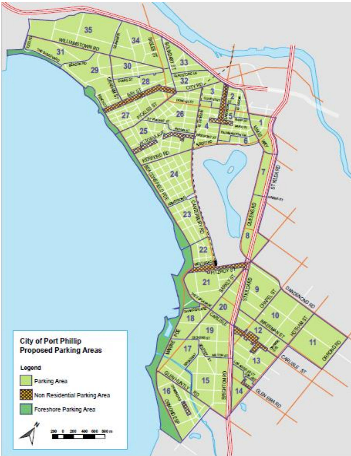
Figure 3: Indicative Residential Parking Area map