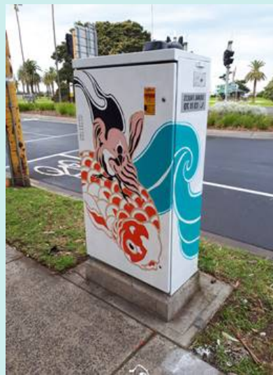
Fitzroy Street, VicRoads Signal Box - After