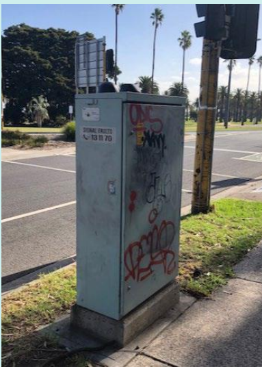
Fitzroy Street, VicRoads Signal Box - Before

Council has worked hard to improve relationships with utilities suppliers, transport providers and other government agencies servicing our City, in order to improve outcomes for our community. This program is an example of the collaboration in practice. Since the artwork was installed, there has been only one instance of graffiti to the units, which was quickly and easily removed thanks to an anti-graffiti coating used to protect the integrity of the treatment.