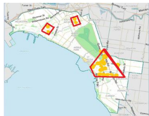
Graffiti hot spot map, December 2018