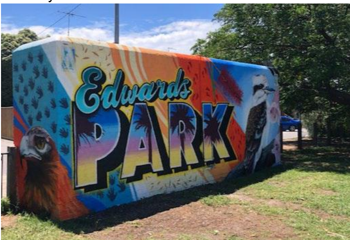
Edwards Park Art Project, supported by the Victorian Government's Community Crime Prevention Program

Council will commit to quarterly community events dedicated to communicating Council's services to our community and engaging our community on how they can reduce the impact of graffiti in their neighbourhood. These community education and engagement events are to be delivered annually.