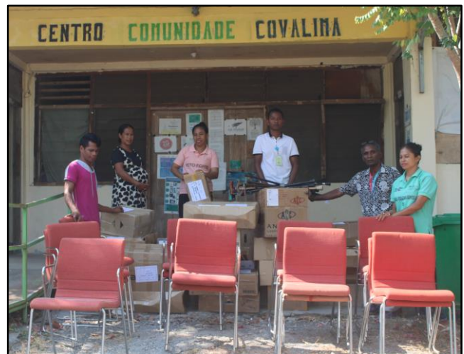
(Right): Staff helping to unpack the equipment as it arrives at the CCC.