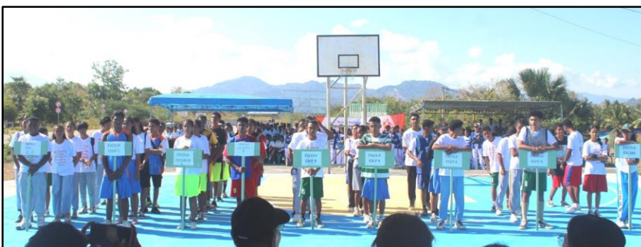
Photo: Four secondary schools in Suai competed in the inaugural tournament at Suai Senior Secondary school.

Four schools competed in the first interschool basketball tournament at the Suai Secondary School in September. The basketball court was resurfaced and upgraded with funds from Friends of Suai supporters including Albert Park College students and the Port Phillip Basketball Association (PPBA). A further donation of basketballs and trophies from PPBA will be sent to Suai this month and distributed to ten schools in and around Suai.