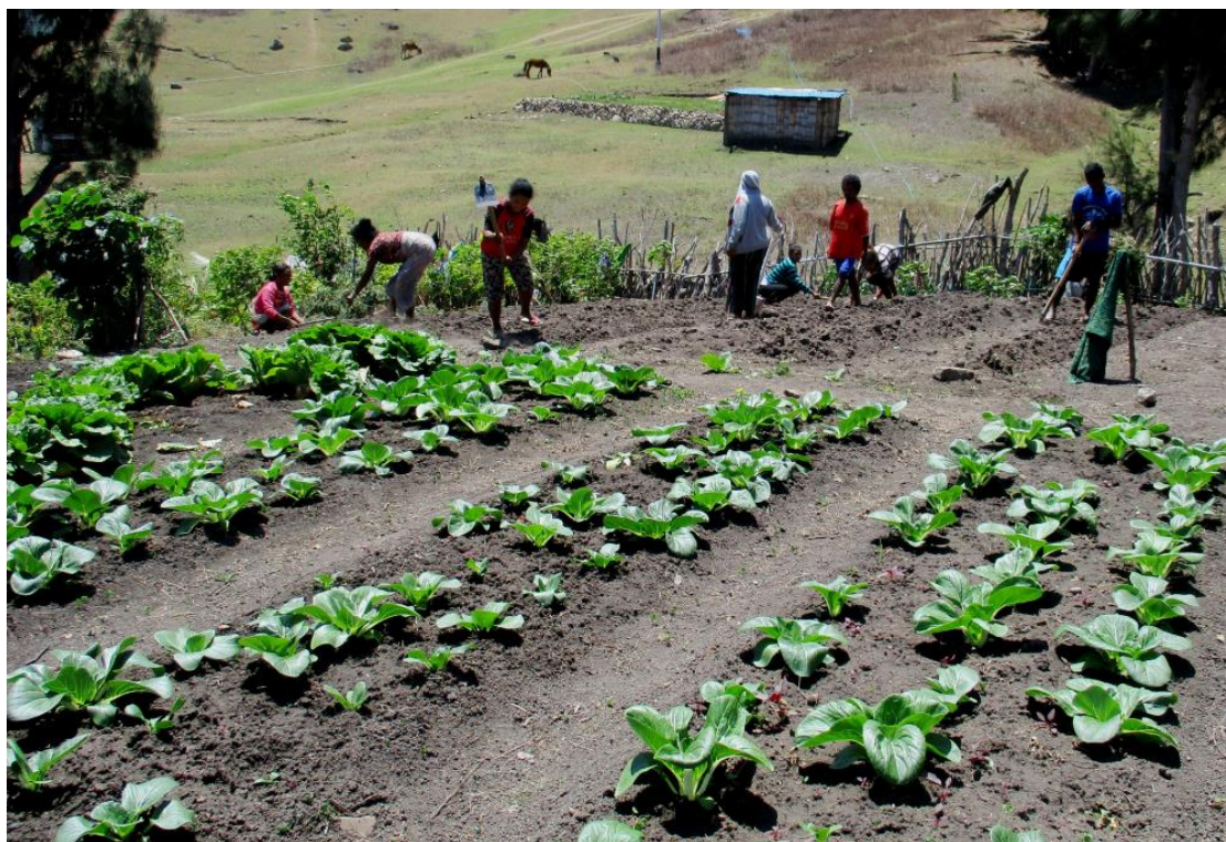
Communities receive training on food production to increase food security and income

The Haforsa team also support the implementation of the 'Romansa' (Saving for Change) program in which groups accumulate their savings and approve small loans to each other from their pooled savings. Groups receive training to set up the program as well as ongoing training and mentoring on financial and organisational management. Saving for Change has been implemented in 16 groups in seven villages in Covalima. The groups have been very successful, and report that the majority of loans are used to support young people with education and to establish small businesses.