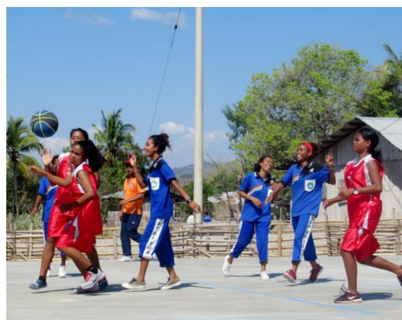
Students at Suai Secondary school enjoying a game of basketball on the new court