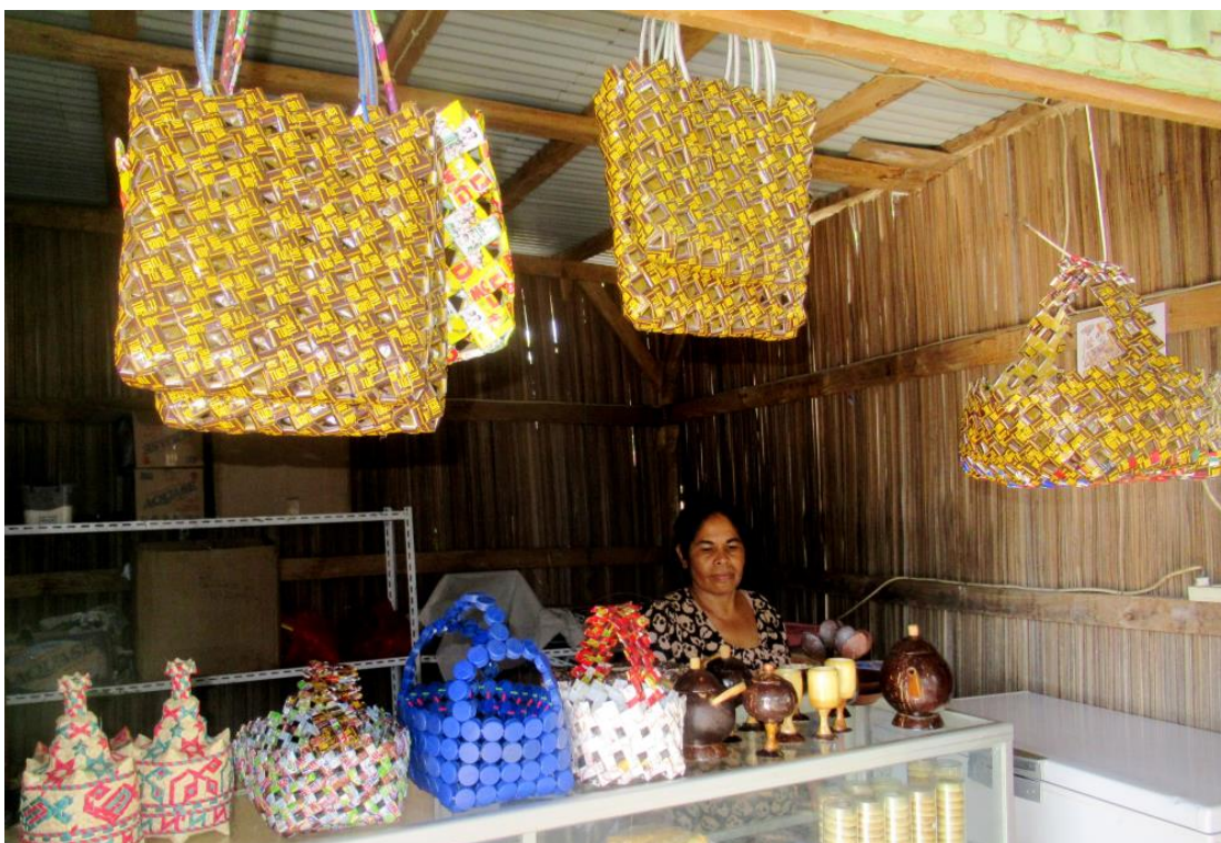
Women in the Rural Women's Development Program sell handicrafts, including bags made from recycled plastic

The partnership with IWDA has expanded to include implementation of a Women's Leadership program so that women can be active participants in village councils. More than 50 women have participated in training called 'Good Decisions, Good Leadership' to develop their confidence and skills in leadership, facilitation, public speaking, conflict resolution and models of decision making. A further objective is to ensure that women understand gender equality and referral pathways for victims of domestic violence.