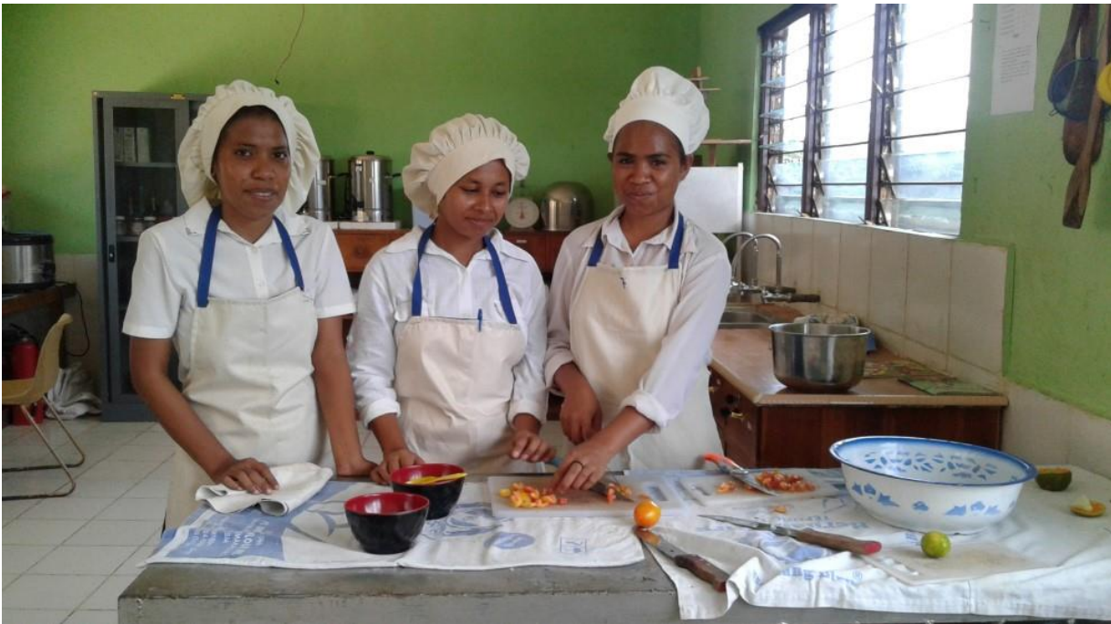
Scholarship recipients studying a Certificate 2 in Hospitality at the local vocational school in Suai.

There are 22 FoSC scholarship recipients in 2020. This cohort includes 16 young women and six young men, with 16 continuing from 2019 and six new places offered to study primary school teaching, hospitality and general construction.