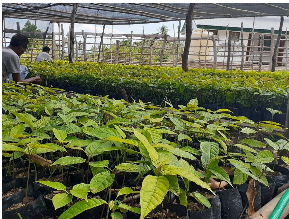
10,000 seedlings were grown in the WithOneSeed nursery and distributed to farmers

FoSC is committed to supporting the establishment of this fantastic initiative as it will have a significant environmental and economic impact in the communities in Tilomar sub-district.