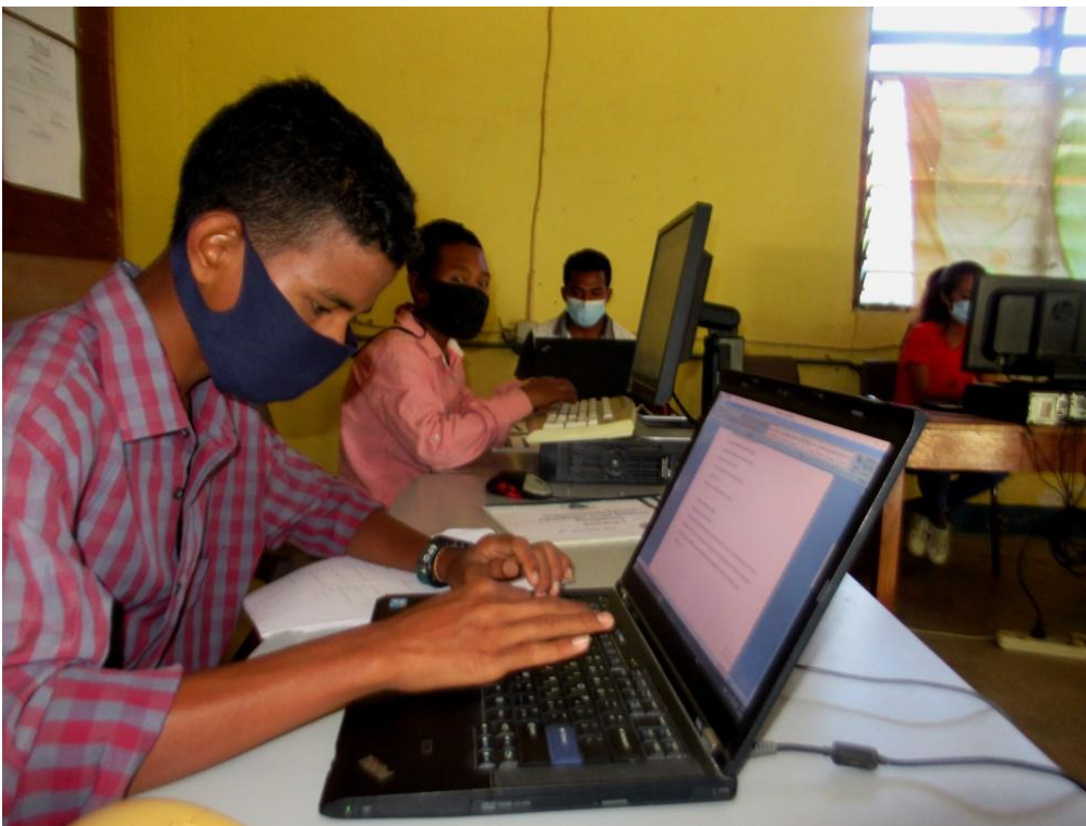
Many young people attend computer training at the CCC

Training completion numbers have been lower than expected because of disruptions caused by the global pandemic and State of Emergency. The team is anticipating increased numbers in the coming months.