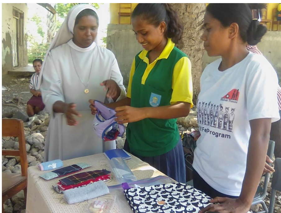
'Days for Girls' menstruation kits were distributed to students during health and hygiene training