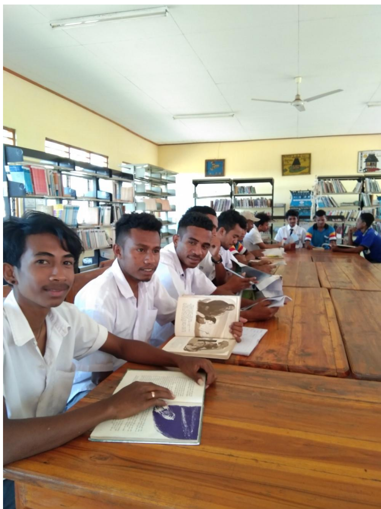
Students reading bookings in the Suai Secondary School library

A small library at the CCC contains books, cassettes, DVDs and games. Most of these resources are in English and are used by the English teachers during training, and also accessed by CCC staff.