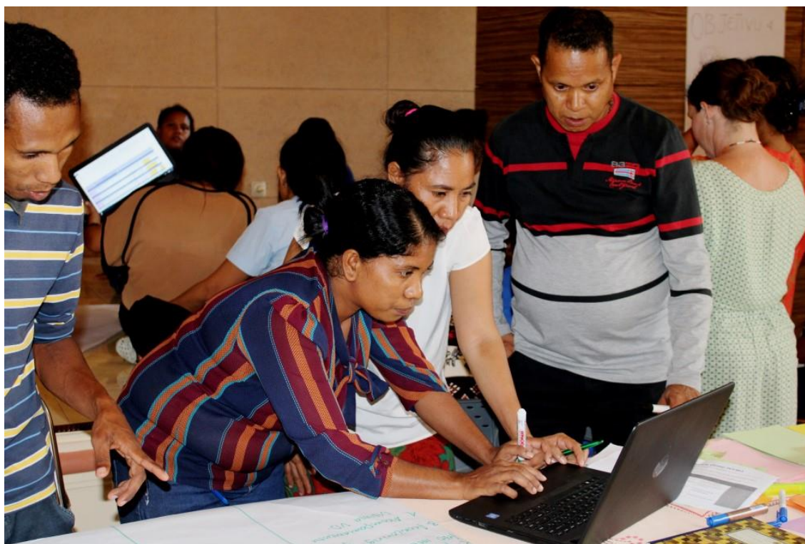
CCC staff participated in Gender Action Learning training in Dili and shared information with the whole team