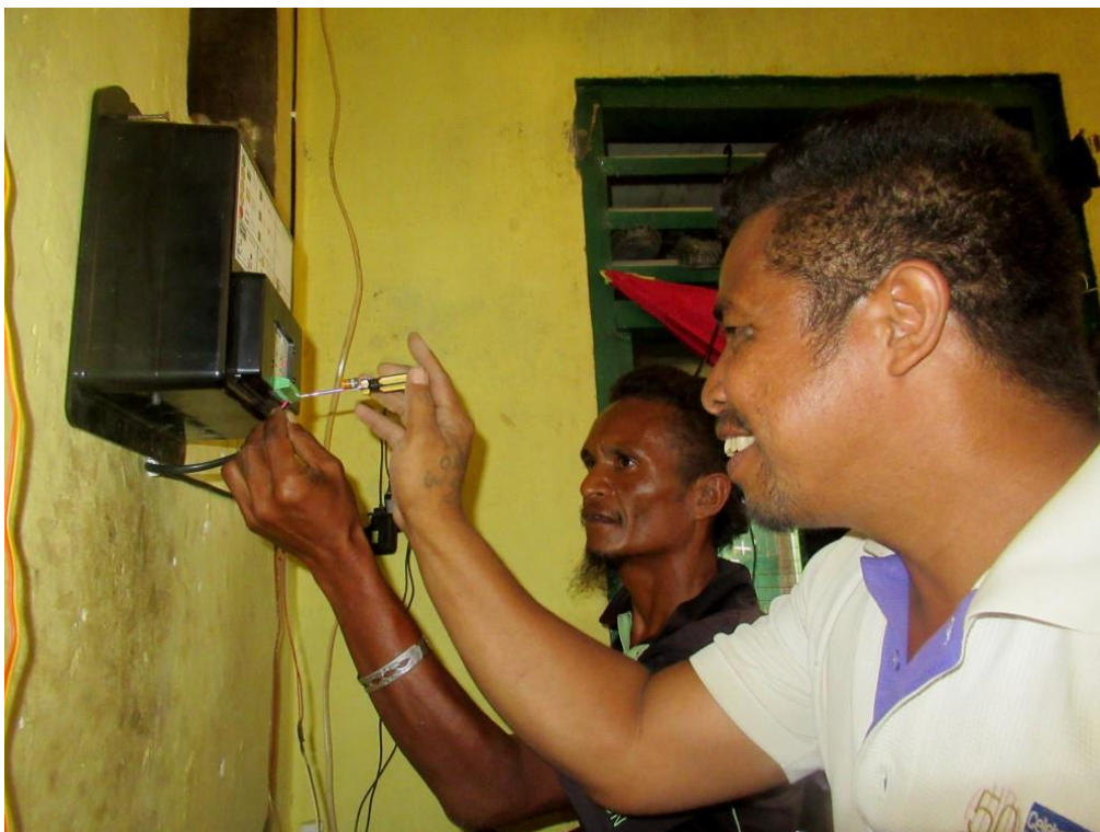
Local technicians are trained to maintain and repair the VLS equipment

The installation of solar panels provides lighting in the evening and removes the need to purchase and use kerosene, bringing social, economic and health benefits to families.