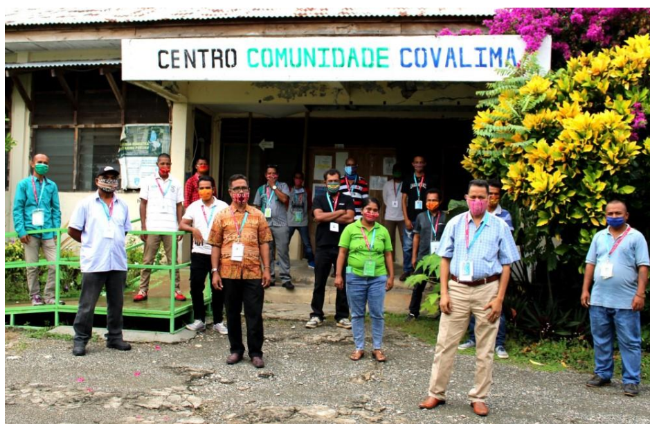
The CCC team demonstrating social distancing at the Centre

This report includes an overview of all CCC activities in order to demonstrate the breadth of programs at the CCC and includes reference to the funding and partners involved.