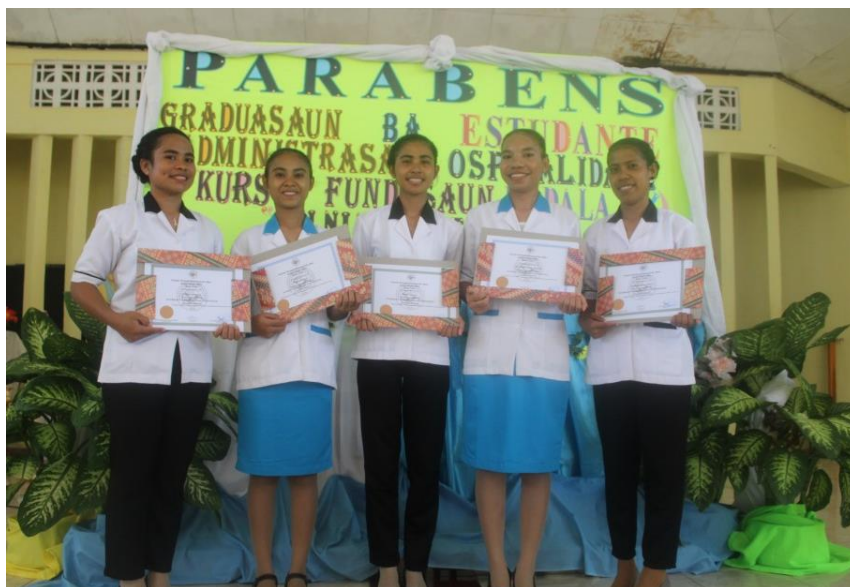
Students graduating from Baucau Teachers College (left) and the Canossian Vocational Training Centre in Suai (right).