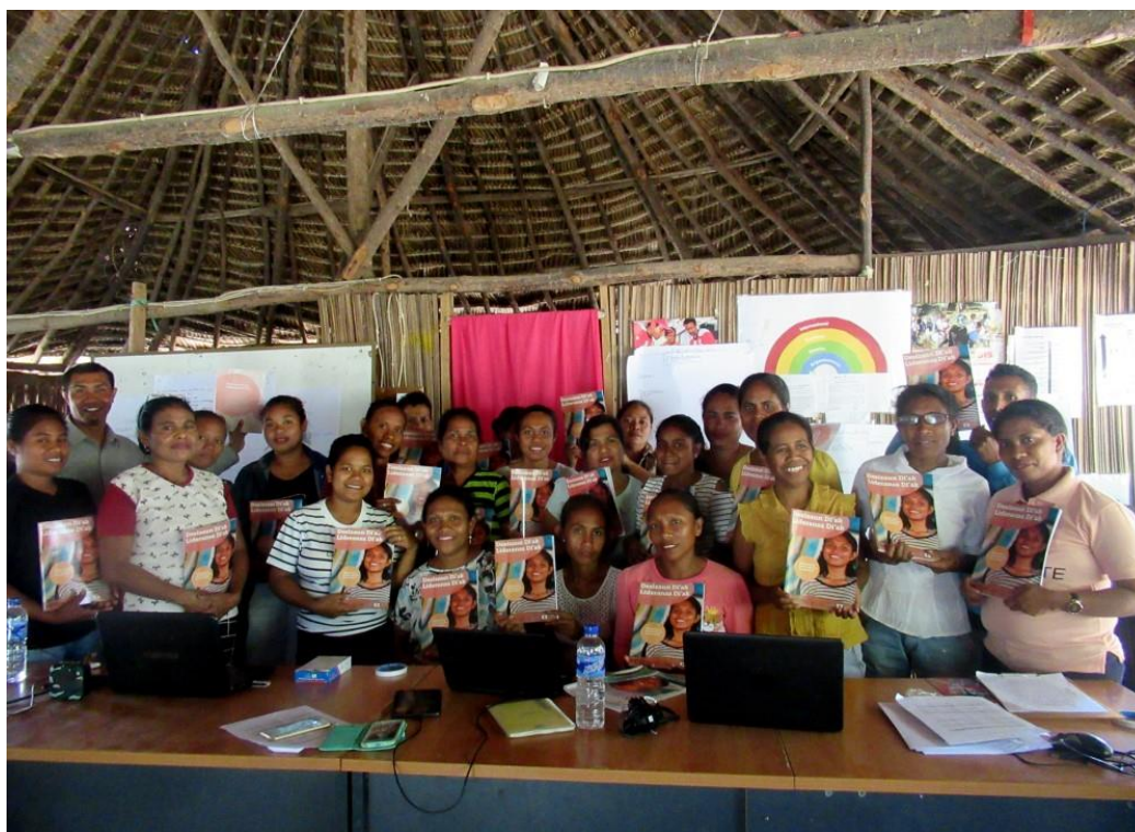
More than 50 women have completed leadership training at the CCC