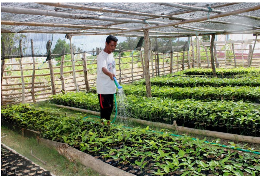
Rotary Club of Balwyn have funded the WithOneSeed nursery, which holds more than 10,000 seedlings

Rotary Club of Balwyn has also made a significant long-term commitment to the WithOneSeed reforestation program in Covalima. The Club has made a three-year commitment to fund the establishment and operations of the WithOneSeed nursery, with a contribution of $15,000 this financial year.