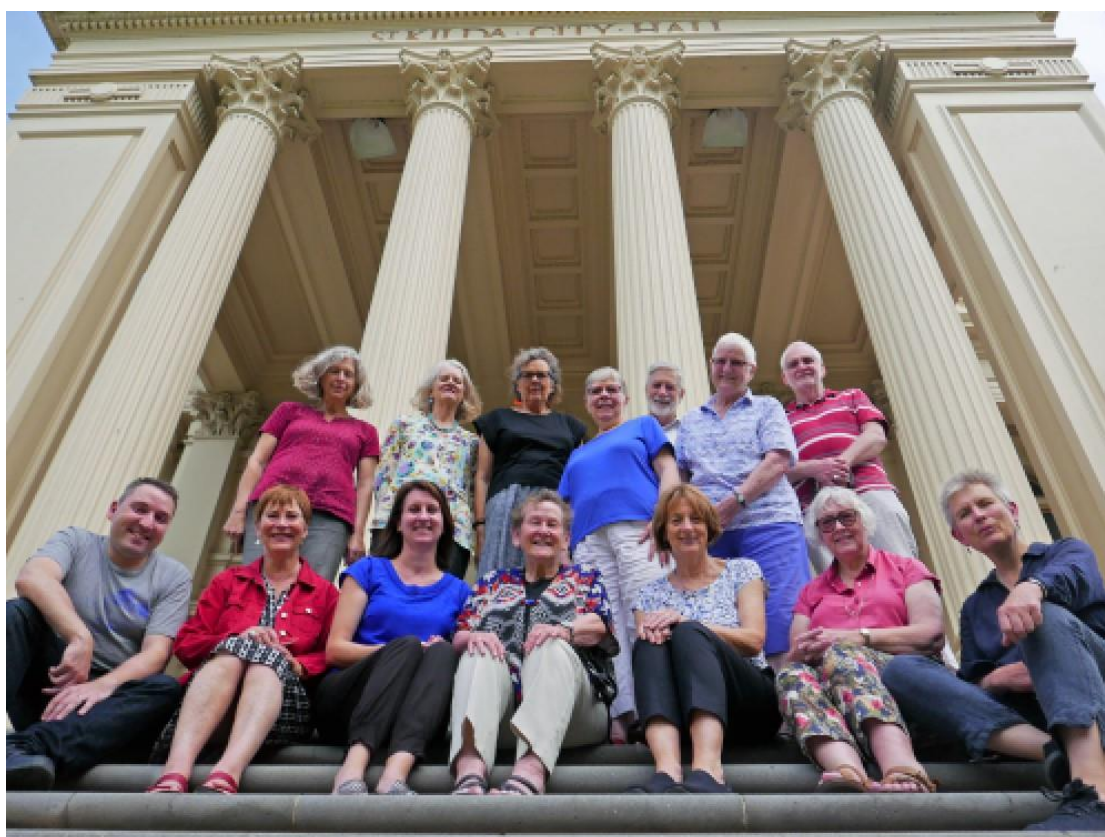
Friends of Suai/Covalima Community Reference Committee members at St Kilda Town Hall, February 2020

Chair, Friends of Suai//Covalima Community Reference Committee