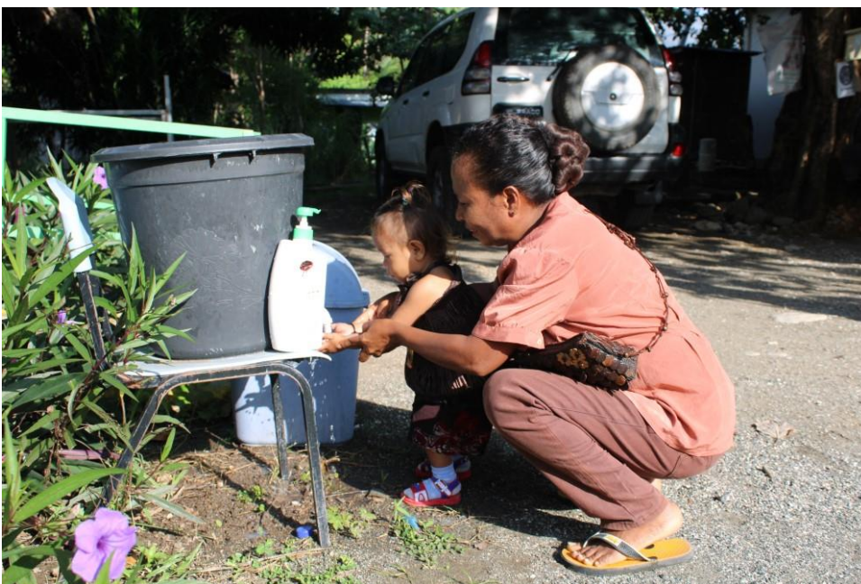
Handwashing training starts early at the CCC

The CCC team were formally invited to participate in the District COVID-19 Taskforce. This was great recognition for the CCC on their proactive response to the pandemic and their capacity and drive to support their community. As part of this taskforce, the CCC staff were able to travel freely throughout the district and worked in collaboration with other local NGOs and government departments. One of the shared activities was to install plastic water tanks for handwashing in public places around Suai.