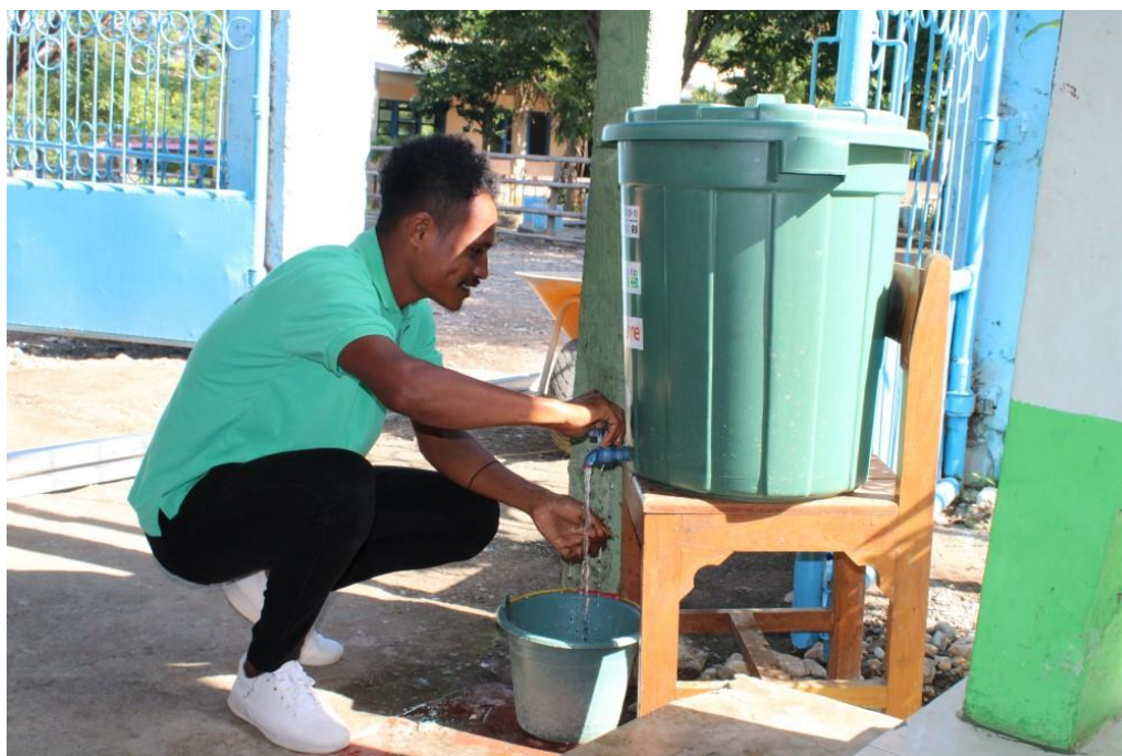
CVTC Suai, the local vocational school, reopened after implementing COVID-safe practices