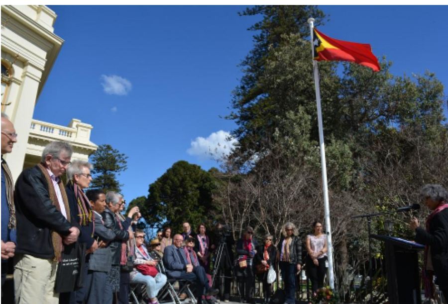
Flag raising ceremony at St Kilda Town Hall

More than 30 people attended the event including City of Port Phillip Councillors and staff. It was a moving ceremony, with passionate speakers sharing their very personal and moving stories and words about the importance of our ongoing friendship.