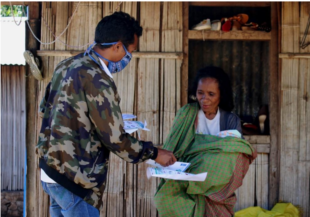
CCC staff distributing information on Coronavirus in a village in Fatalulic sub-district

Many programs and activities were disrupted from March until June 2020 due to the global COVID-19 pandemic and restrictions imposed due to the State of Emergency declared by government during these months. All CCC partners and donors were flexible during this time and were able to reallocate program funds for COVID-19 related activities. This allowed the CCC to respond quickly to assist communities during this time.