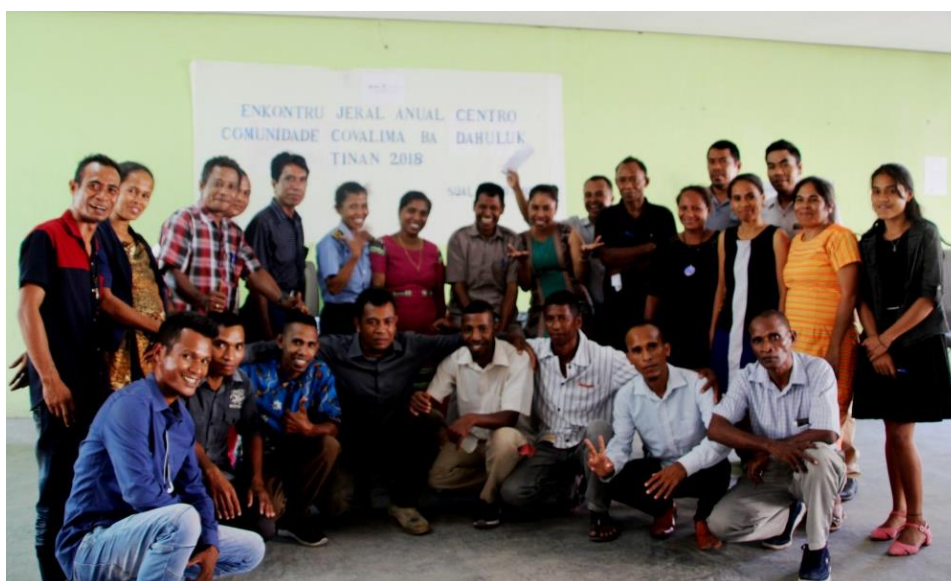
CCC Commission members and staff

The Director of the CCC and the FoSC Coordinator speak every week and have frequent email correspondence, often involving Program Coordinators. These discussions inform regular Coordinator Reports to the FoSC Community Reference Committee.