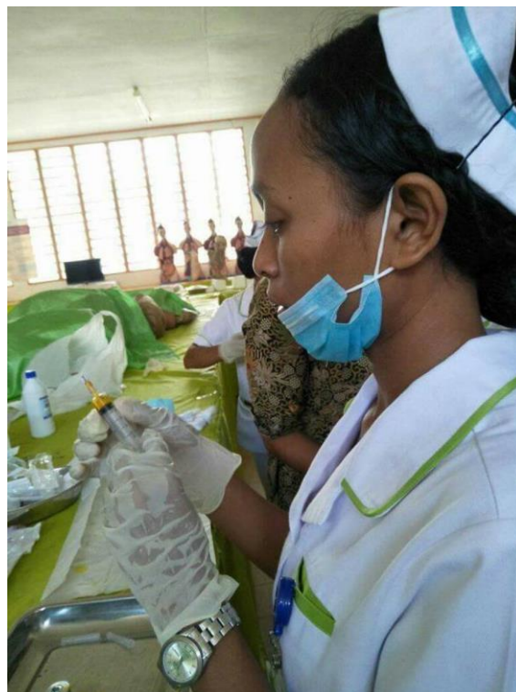
Scholarship students practising their skills in general construction (left) and nursing (right)