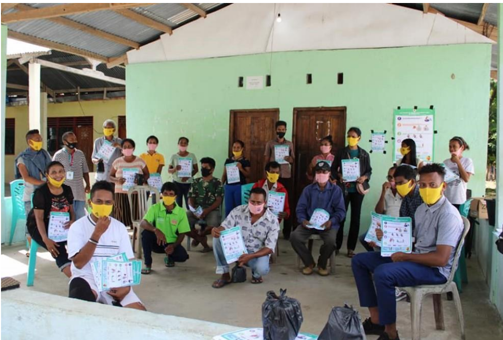
WHO posters have been distributed to 125 villages in Covalima district

The CCC has also been invited to join the District Disaster Management Committee, in the area of Prevention, Preparation and Mitigation. This is in recognition of their programs that support Disaster Risk Reduction activities. As part of the taskforce, they are involved in rapid assessments for disasters, including the emergency response after flash flooding events that occurred in Covalima.