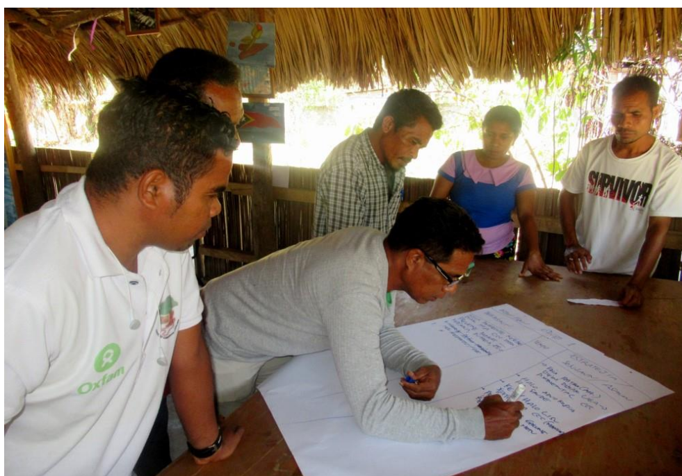
CCC staff participate in many training programs and workshops along with local partner organisations

Once endorsed, the 2020-25 plan will be made public and will guide the work of the FoSC. Later in 2020, the CCC team will commence the process of reviewing and updating their strategic plan.