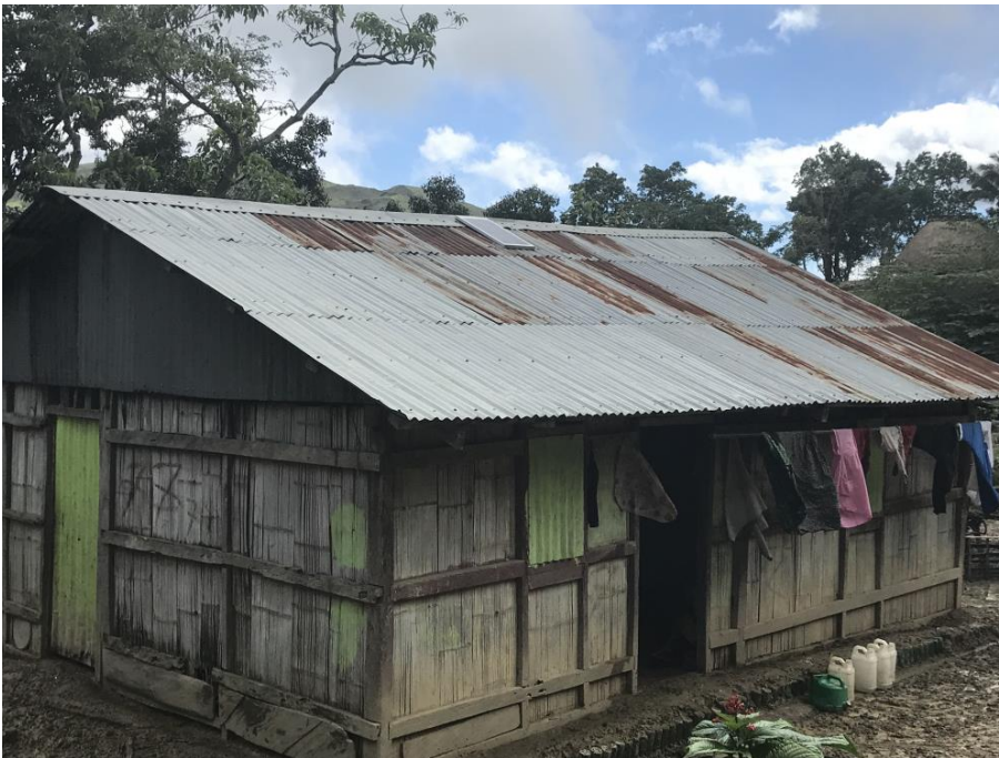
A small solar panel has been installed on this house roof as part of the VLS program in Halik Nai