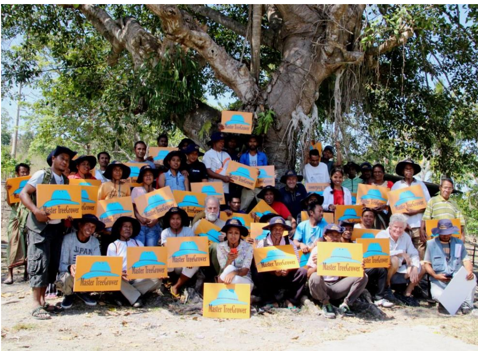
Master Tree Growers training participants in Lalawa

An important part of the success of the program is the delivery of practical agroforestry and permaculture training and to develop the capacity of communities to replant and maintain their forests. In September 2019, 32 farmers participated in a four-day Master Tree Grower program. Building on local knowledge, farmers shared information and received training and information on seed selection, tree planting and maintenance.