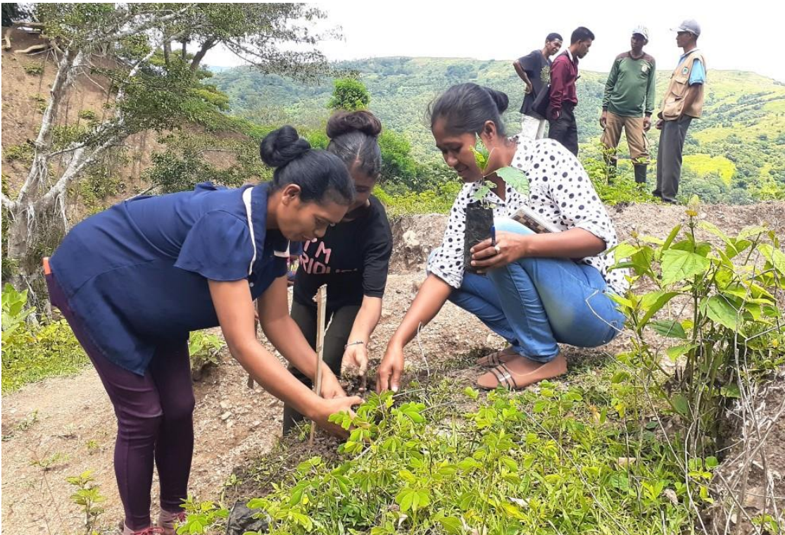
Planting trees is an activity in the Disaster Risk Reduction program at the CCC

The staff involved in these programs were also involved in establishing a national association for DRR and actively participate in this network to share challenges and achievements.