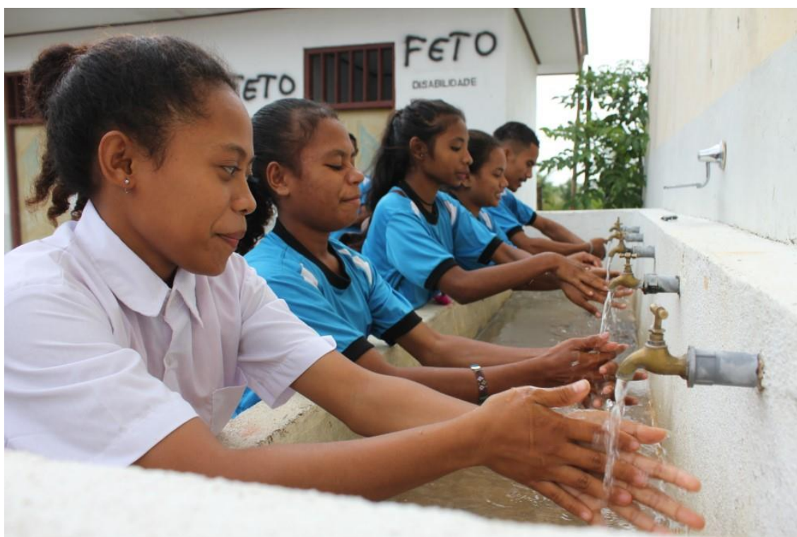
The FoSC WASH project has ensured the Suai school community has access to running water and toilets

Although cases of COVID-19 in Timor-Leste remain low, the land border between Covalima district and Indonesia continues to pose a threat. At the CCC, the staff have implemented safe practices around handwashing, cleaning and social distancing. They will continue to role-model behaviour, share information and provide training to communities.