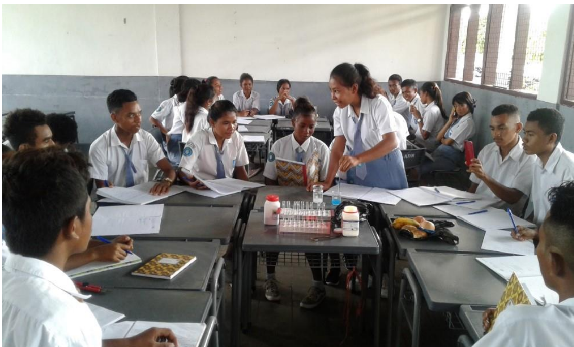
Students using the science equipment donated by FoSC

The Knua Pratika (KP) group borrow the science equipment from the Suai Secondary school library and have provided training to an enthusiastic student group called EPHA. In celebration of the International Day of Science and Mathematics, seven teachers from the KP group and 14 students from EPHA participated in a national science fair in Same district. Science equipment was borrowed from the library for these activities.