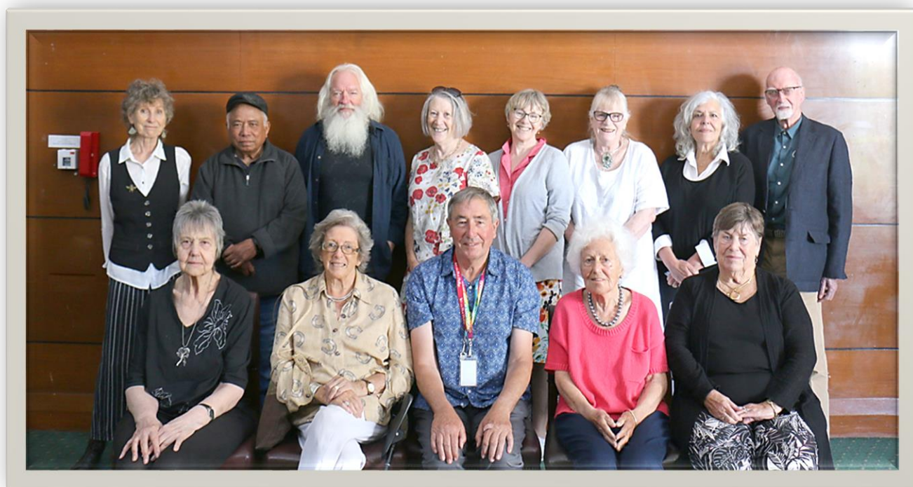
Pictured, OPAC members December 2021.