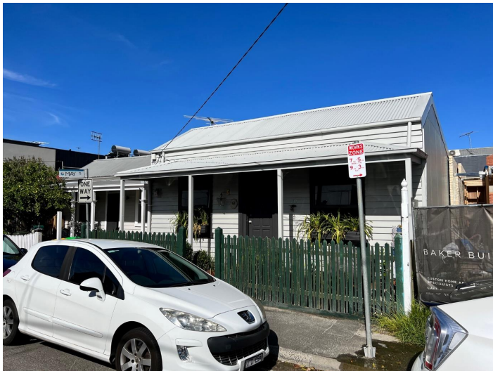
Image 5: 130 Albert Street, adjacent neighbouring dwelling to the east.