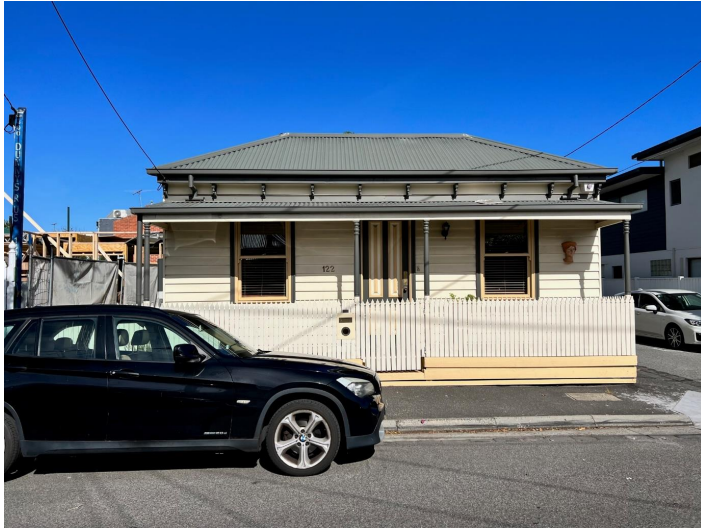
Image 6: 122 Albert Street, adjacent neighbouring dwelling to the west.