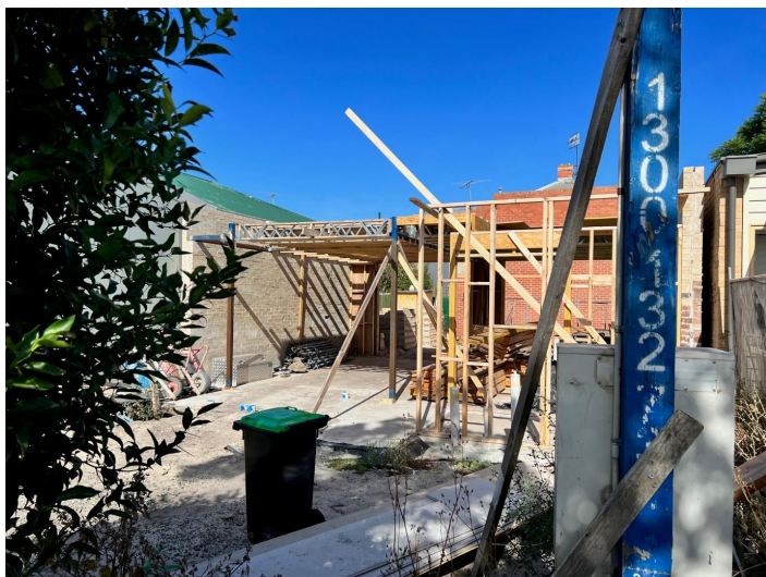
Image 3: 126 Albert Street, site of demolished dwelling.