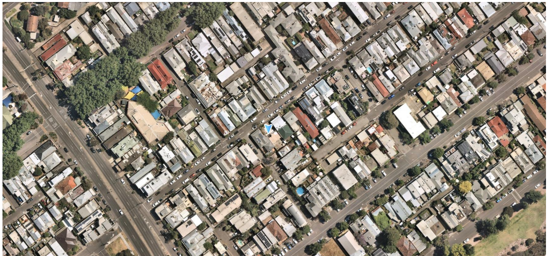
Image 9: Aerial photo of the wider neighbourhood.