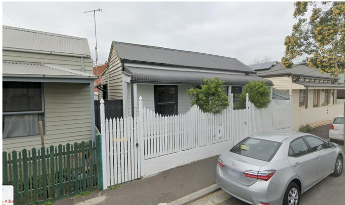
Image 1: Photo of the demolished dwelling from the delegate report for 43/2021.