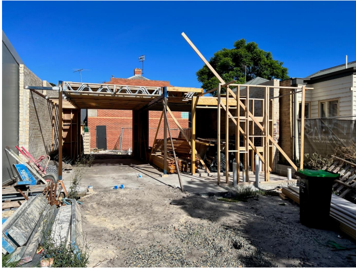
Image 4: 126 Albert Street, site of demolished dwelling.