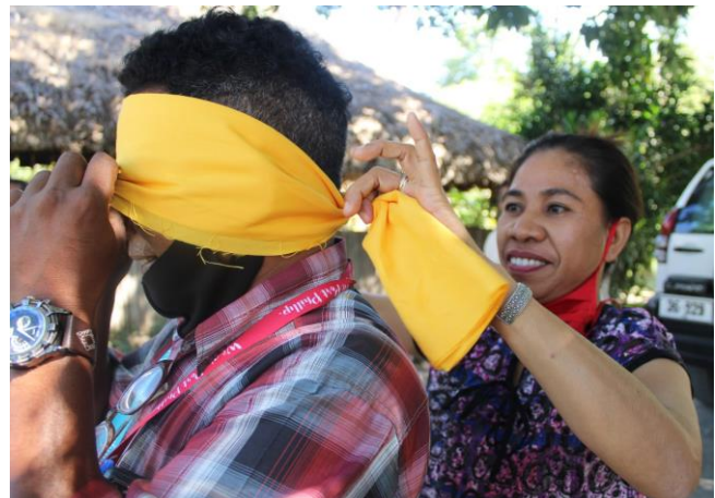
CCC staff participate in a range of workshops and training programs each year.