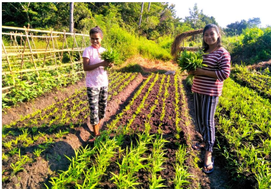
Students at Maliana Agricultural Secondary School completing their final year practical placement in the school garden.

In 2021, six new scholarships were offered for students to study primary school teaching (2), hospitality (2) and general construction (2). There are also a further 14 students ongoing, who are continuing to study agriculture (2), electrical studies (2), primary school teaching (7) and community development (2). Additionally, two Community Development students and two Midwifery (Nursing) students finished their fourth year in 2020 and are still receiving some support while they finish their final placements and research.