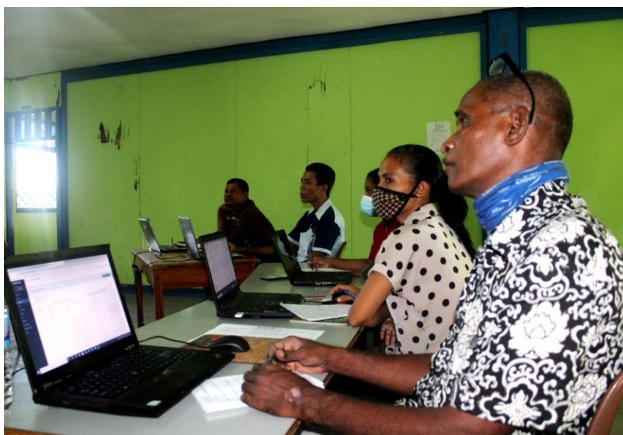
The CCC finance team participated in 5 days Quickbooks training

Each year the CCC is externally audited by CC Business Solutions in Dili. Audits are funded by CCC partners and the 2019/20 audit was fully funded by FoSC. The audit was conducted in September 2020. The CCC has received a clean audit report and has implemented recommendations from the auditors, including further training on the use of Quickbooks.