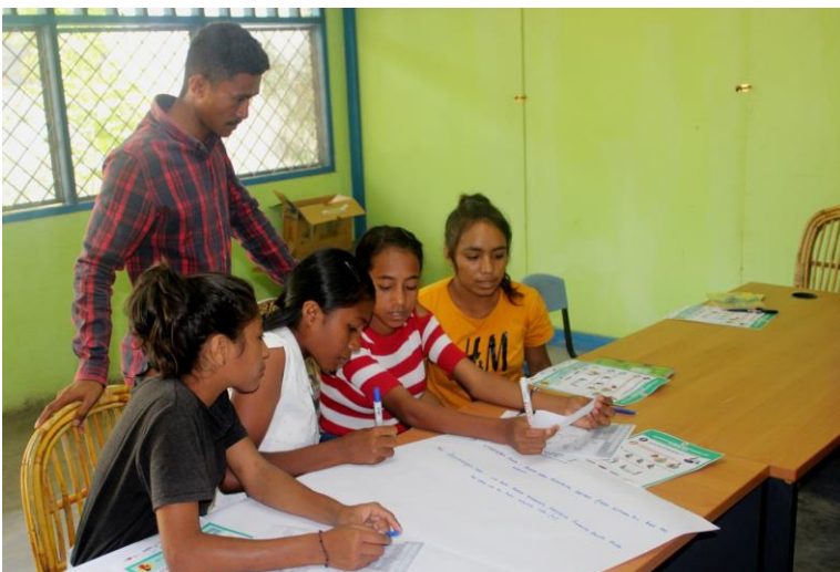
English language and computer training courses at the CCC now include a health & hygiene component

English language students are encouraged to access the mini library set up at the CCC, which includes over 2,000 books, DVDs and games donated by FoSC. The library is also used by CCC staff and scholarship students during their school holidays.