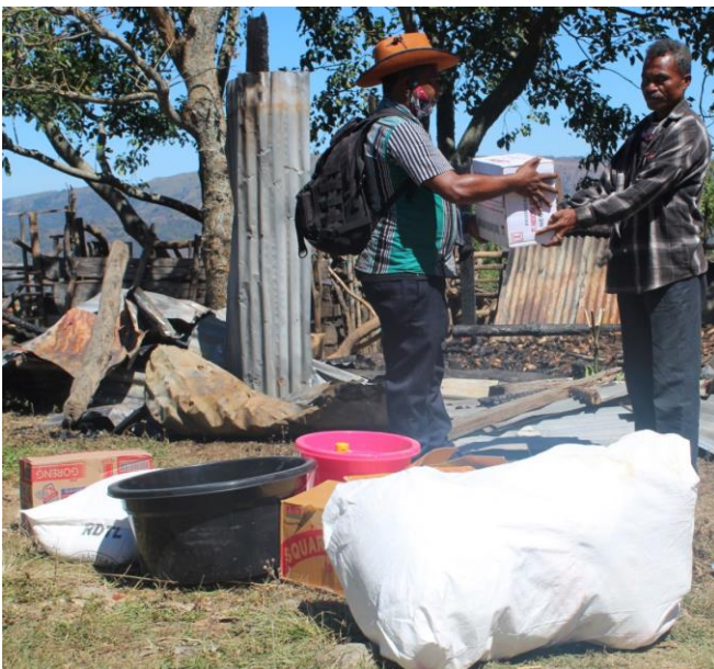
Distributing emergency supplies to communities

The staff involved in these programs were also involved in establishing a national association for DRR and participate in quarterly meetings with stakeholders including Sub-District Management Committees. They have supported communities to develop disaster management plans to implement in each village and provided training with the aim to improve each community's knowledge of preventing and mitigating disaster risks.