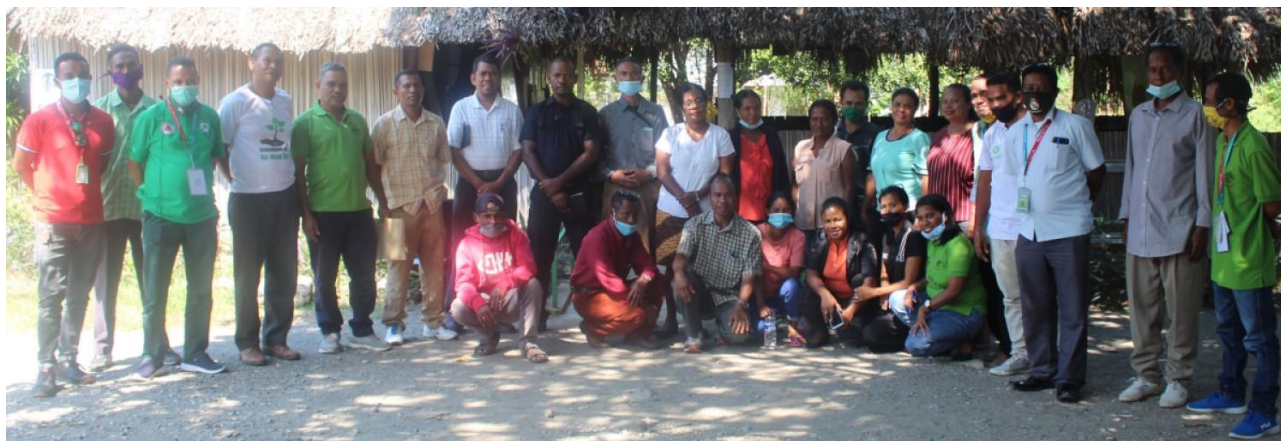
A DRR stakeholder meeting held at the CCC

The CCC has been successful in their submission to international NGO Give2Asia for a food relief program to support vulnerable households in many villages throughout Covalima. This program will be implemented in July 2021.