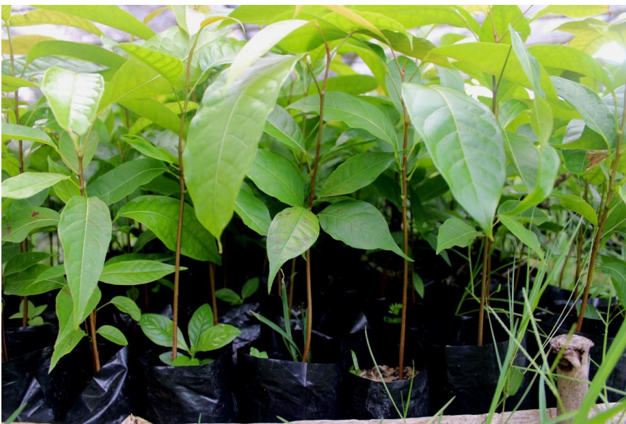
Mahogany seedlings growing in the WoS nursery February 2021

The FoSC Strategic Plan 2020-25 was endorsed by Council on 2 September 2020.