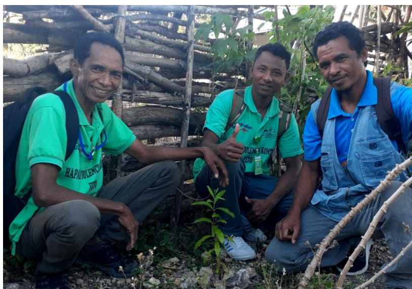
WoS team members monitoring trees, August 2020