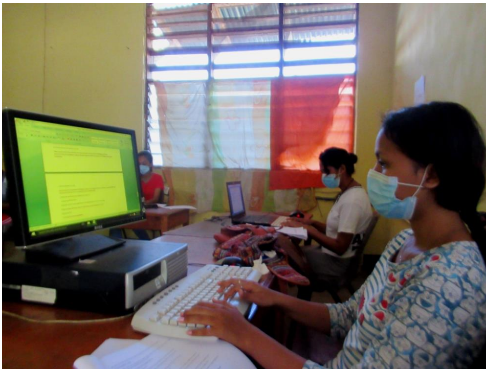
Computer training courses now incorporate Coronavirus protocols

FoSC has facilitated the ongoing development of IT services in Suai with regular donations of second-hand computers since 2007. Computers and accessories are donated by community members and through the City of Port Phillip Council disposal program. Although community demand is high, stock levels remained low so income from computer sales and repairs was limited this year. A shipment of computers was packaged and sent from Port Phillip to Timor-Leste in April and will arrive in July 2021. It contains 20 desktop computers and keyboards from CoPP and additional donations of accessories from volunteers.