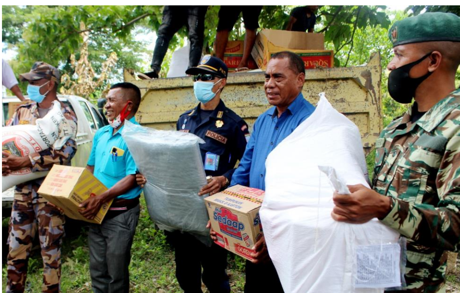
The Municipal Administrator (second from right) distributed emergency supplies to villages after severe floods in April 2021.