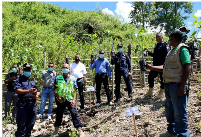
Left: Mahogany seedlings in the WoS nursery January 2021, Right: Tree planting and WoS program launch, 15 April 2021