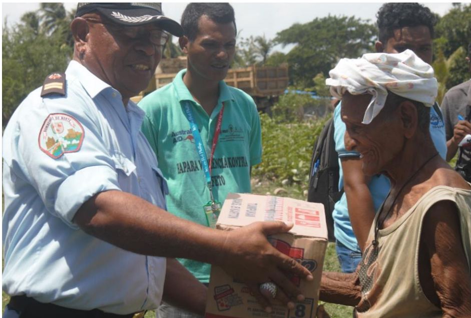
Delivering emergency supplies to flood affected villagers, December 2020

The CCC actively participate in the District Disaster Management Committee and has been involved in the emergency response in these situations. The CCC has experience delivering programs focussed on disaster risk reduction, so they are well placed to support local government and communities to undertake rapid assessments and distribute emergency supplies. Any costs incurred are funded through the Civic Health Fund.