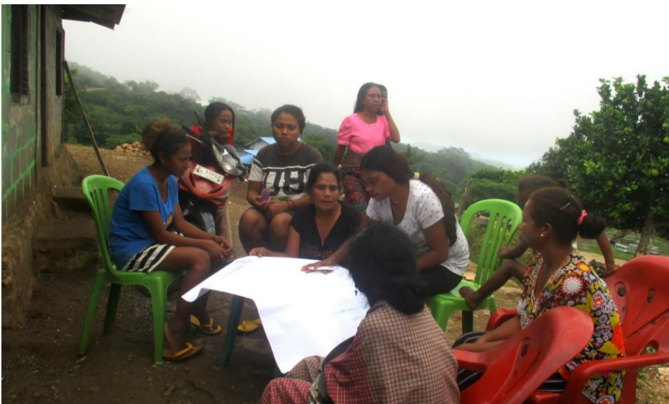
Social inclusion training is part of the Australian Humanitarian Partnership program, June 2021

Although funding of the Haforsa program ended in June 2020, CCC staff are now working with the same communities and beneficiaries on the Oxfam funded Australian Humanitarian Program (AHP) with a focus on disaster risk reduction.