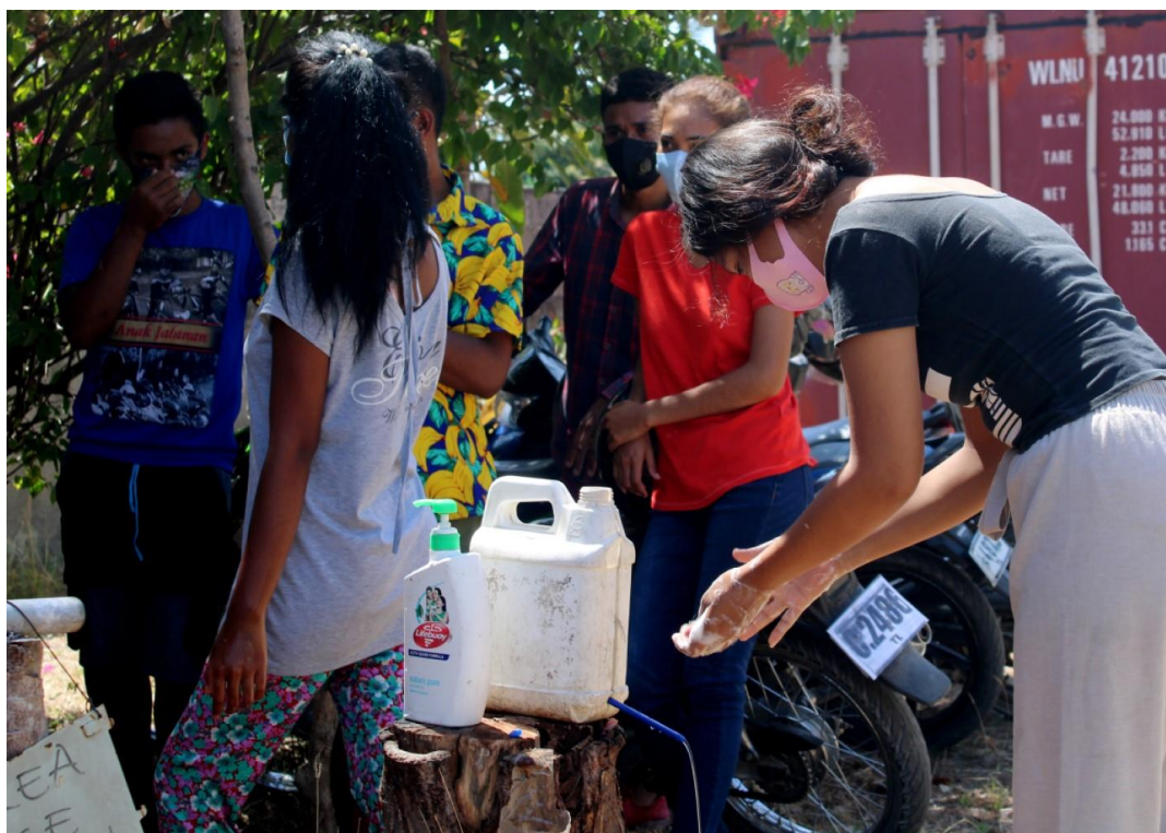
Handwashing training is provided to all students doing training at the CCC

Costs for the training are minimal and are funded through the Civic Health Fund established with funds by FoSC since June 2020.