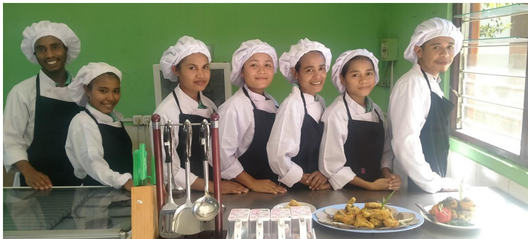
Hospitality students at the Canossian Vocation Training Centre in Suai, April 2021