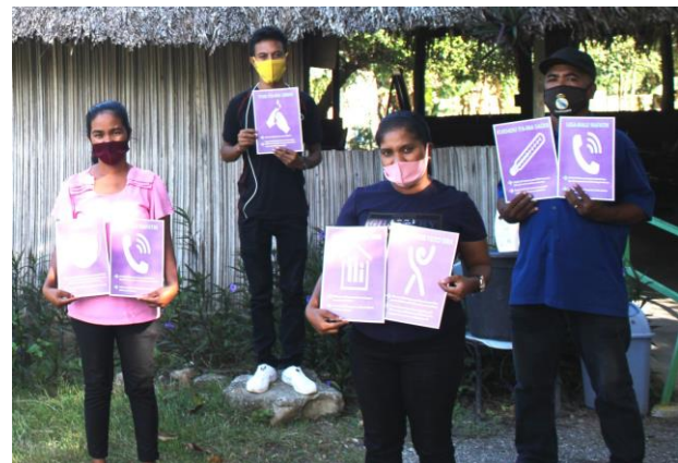
Left: CCC staff are regularly disinfecting quarantine and isolation centres in Suai, June 2021,