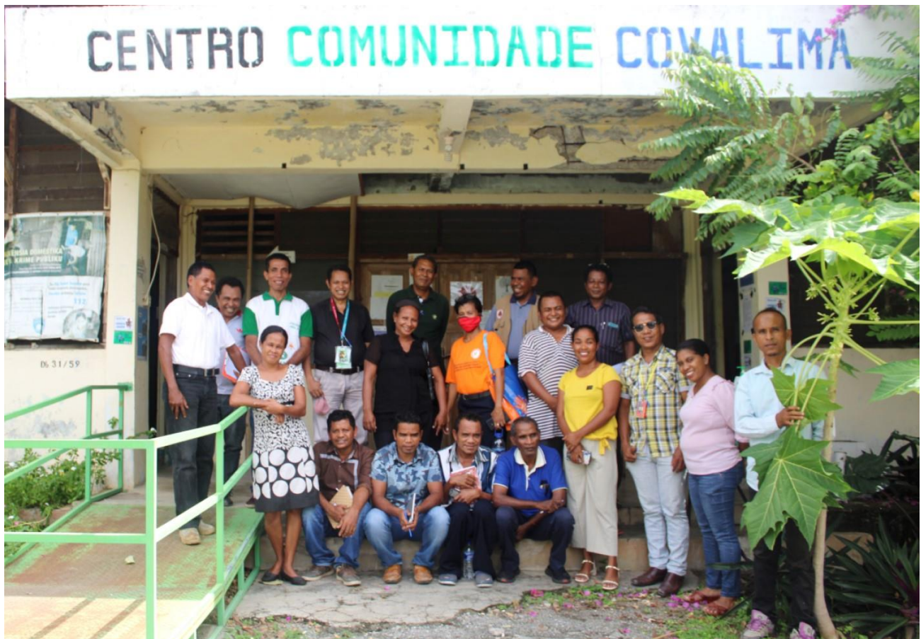
Staff and Commission members at the Covalima Community Centre.