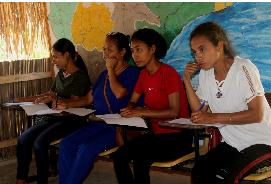
The RWDP program quarterly forums are an opportunity to share skills and challenges (left) and leadership training for members of Village Councils (right)