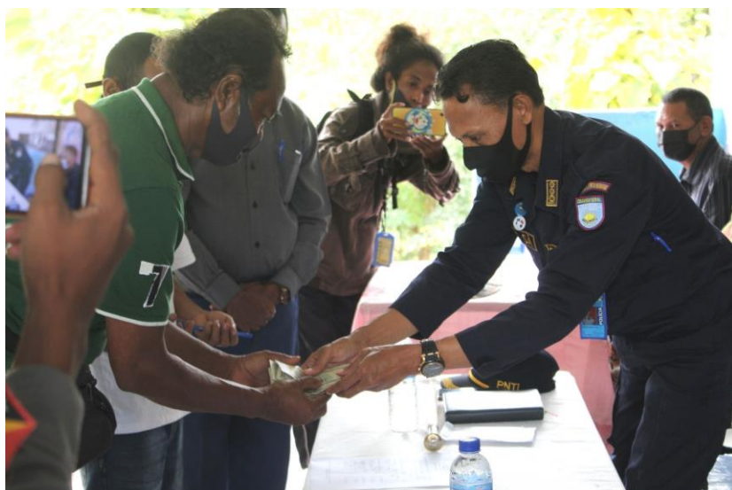
First annual payments to WoS farmers on 23 June 2021

FoSC is committed to supporting the establishment of this fantastic initiative as it will have a significant environmental and economic impact in the communities in Tilomar sub-district.