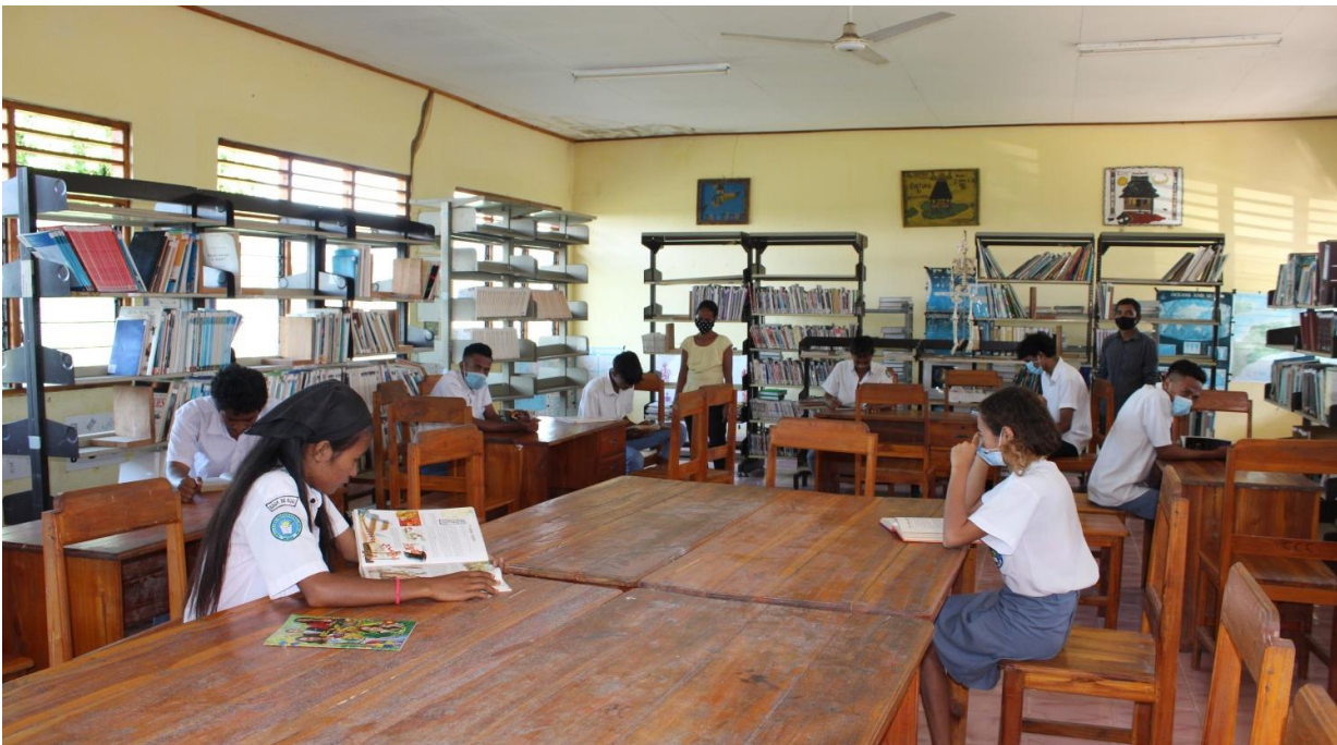
The Suai Secondary School library continues to be well utilised by students

More resources will soon be added to the collection as a shipment containing books and science equipment, donated by FoSC volunteers, is due to reach Suai in July 2021. This year a collection of books donated by the Australia East Timor Association, also due to arrive in July, will also be added to the library collection.