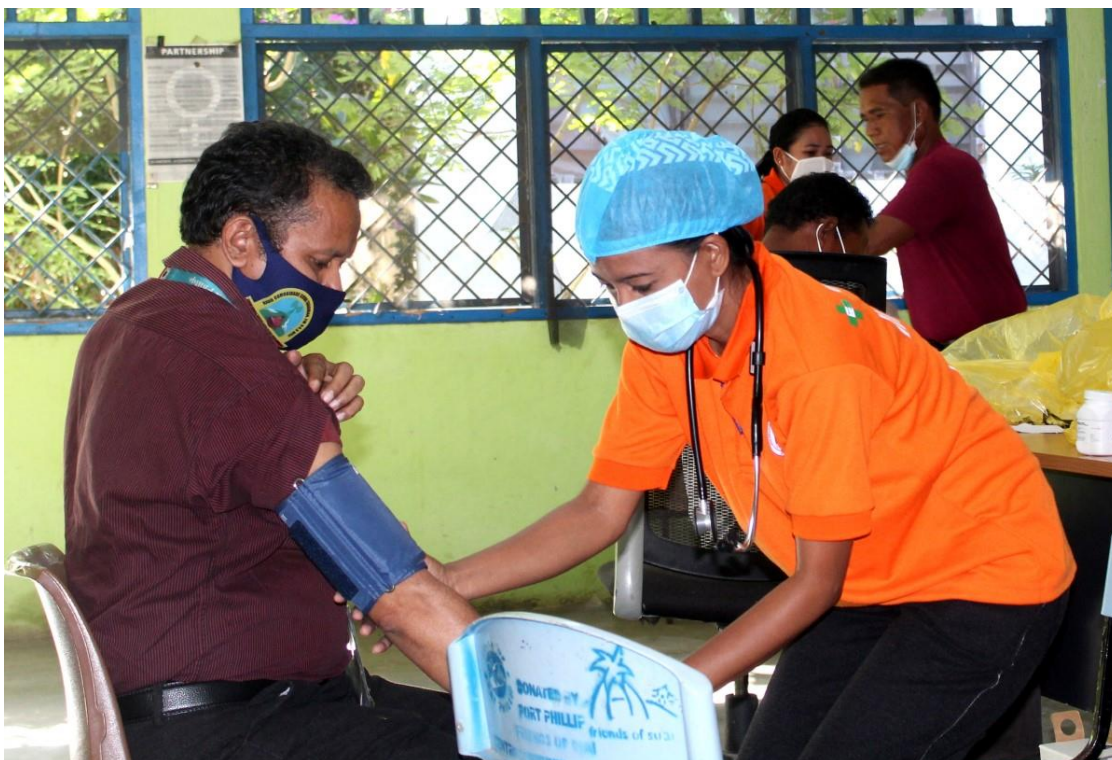
30 CCC staff received their first Coronavirus vaccines in June 2021.

The CCC team is also focussed on embedding health promotion messaging into training programs delivered at the CCC, at local schools, and in all communities where CCC programs are implemented.