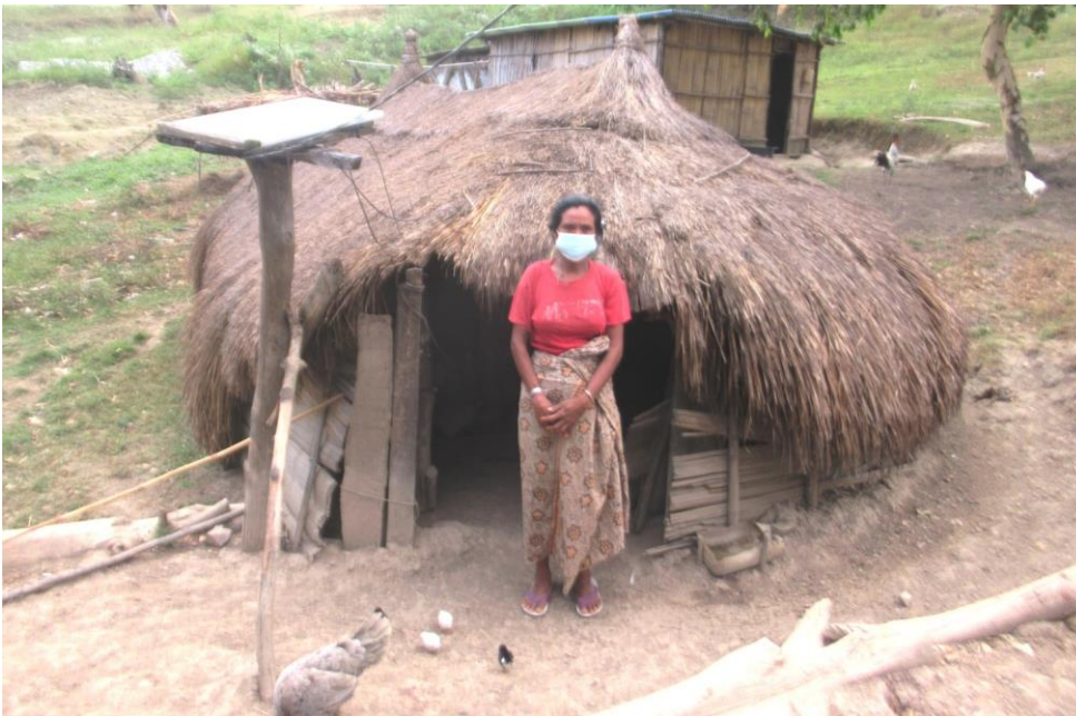
The CCC team has distributed masks and soap to many remote villages along the border with Indonesia.

Additional funds will soon be available as the CCC has successfully applied for funding through international NGO Give2Asia to provide food relief to more than 200 families.