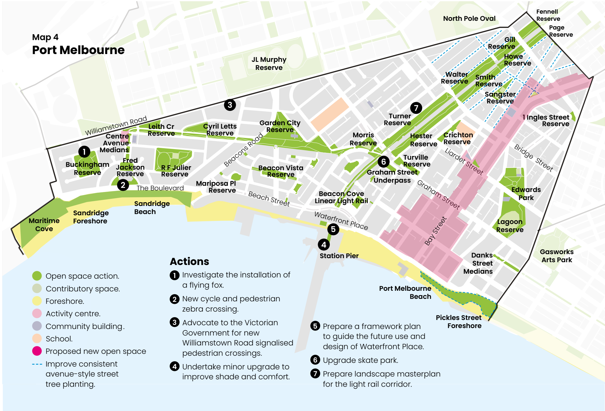
Map 4 Port Melbourne