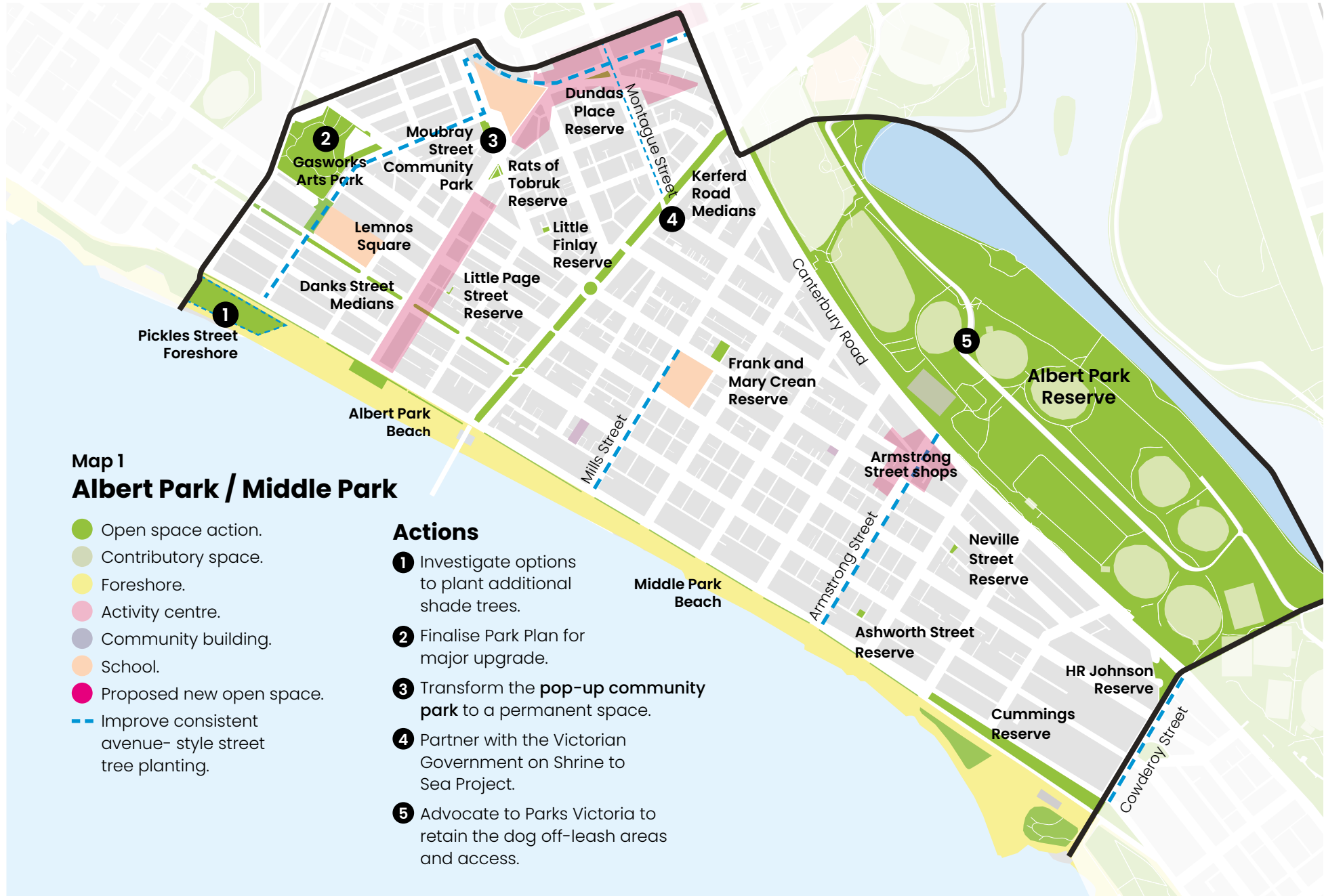
Map 1 Albert Park / Middle Park