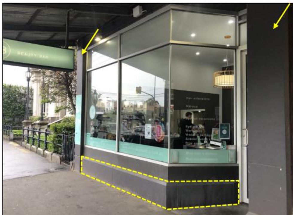
Figure 12 Existing shopfront to number 150. Granite to the shopfront plinth is to be salvaged for reuse, granite to the pillar's to be retained.

shopfront then originally thought and the shopfront retains its original arrangement of side entry and splayed display window, albeit now replaced with aluminium framed windows.