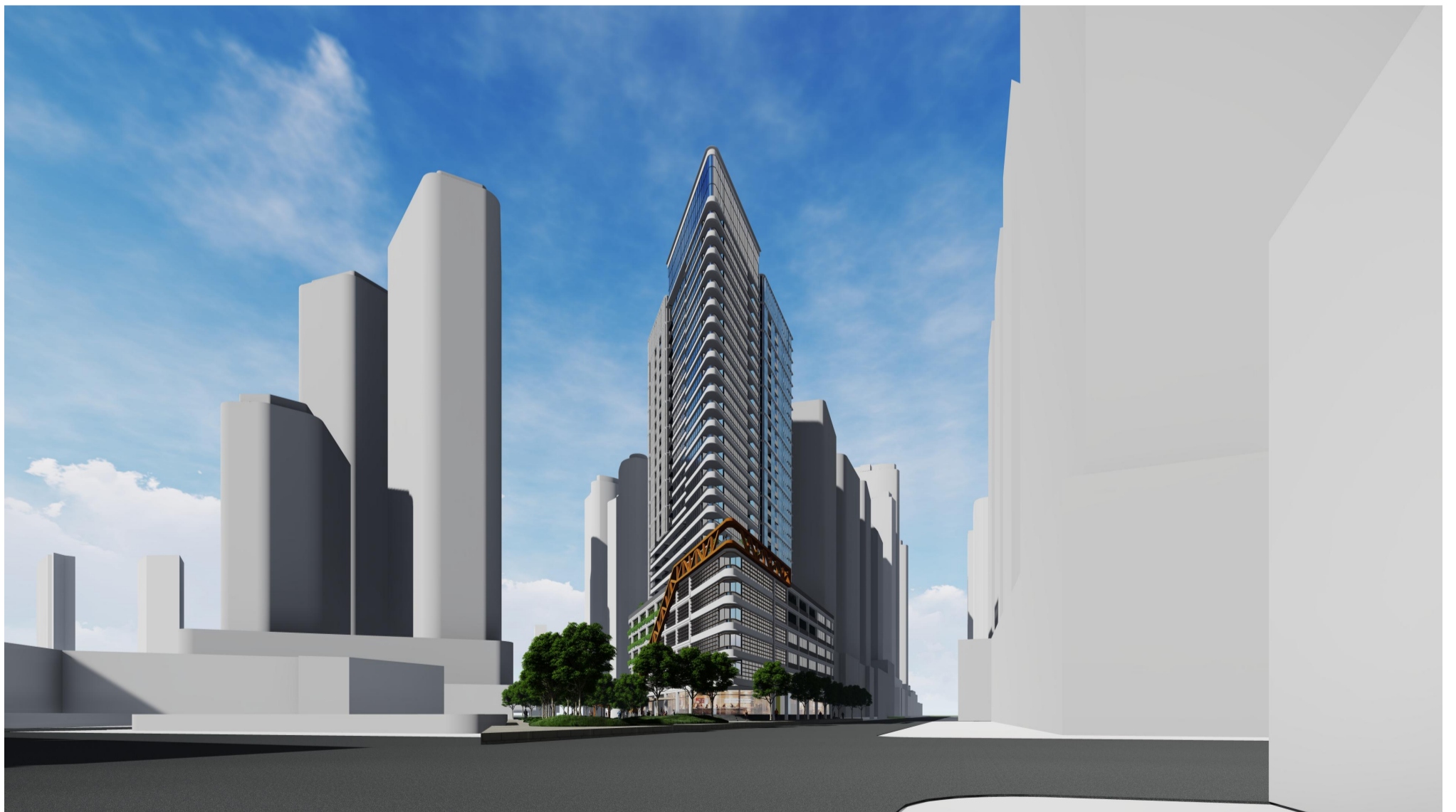
VIEW FROM NORMANBY ST AND JOHNSON ST INTERSECTION