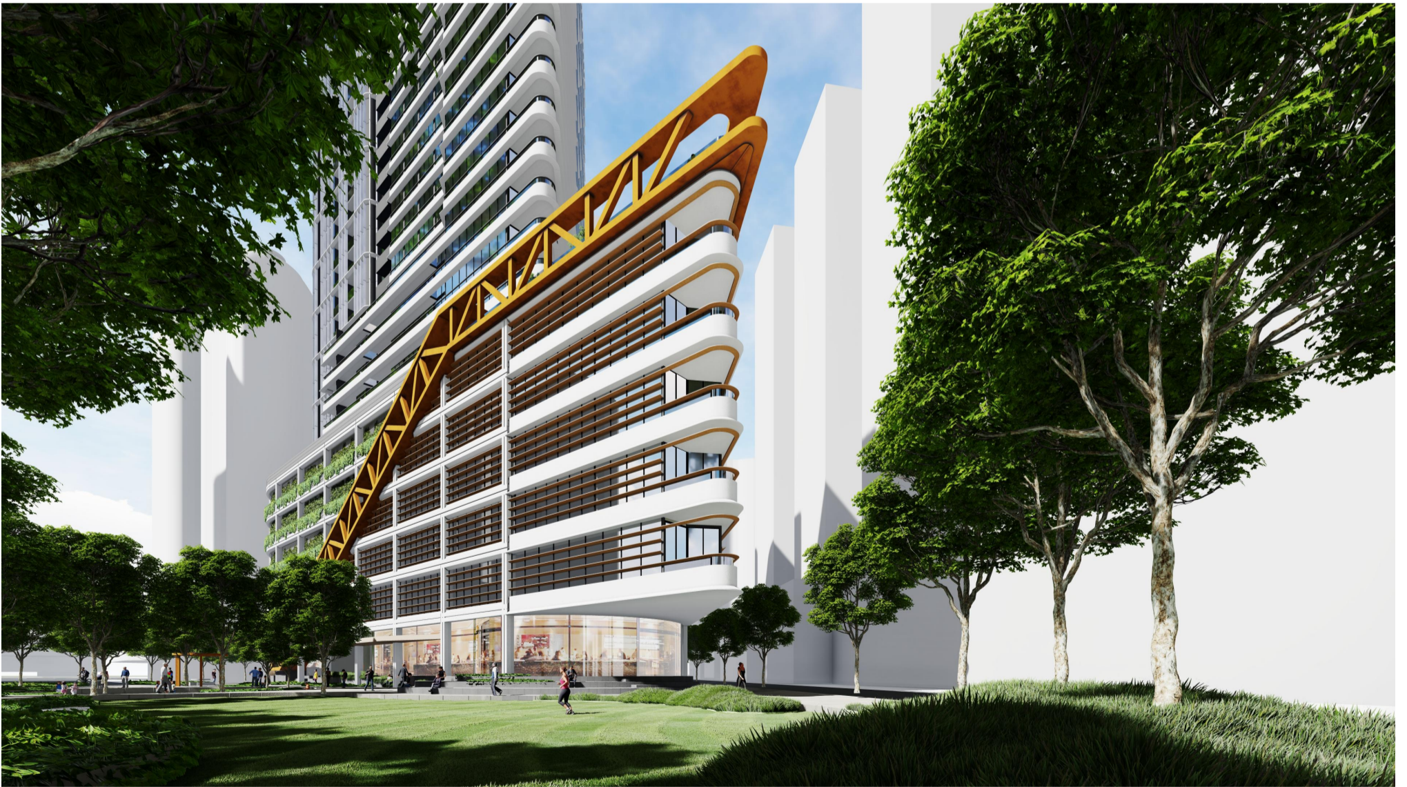
VIEW FROM PROPOSED JOHNSON STREET PARK