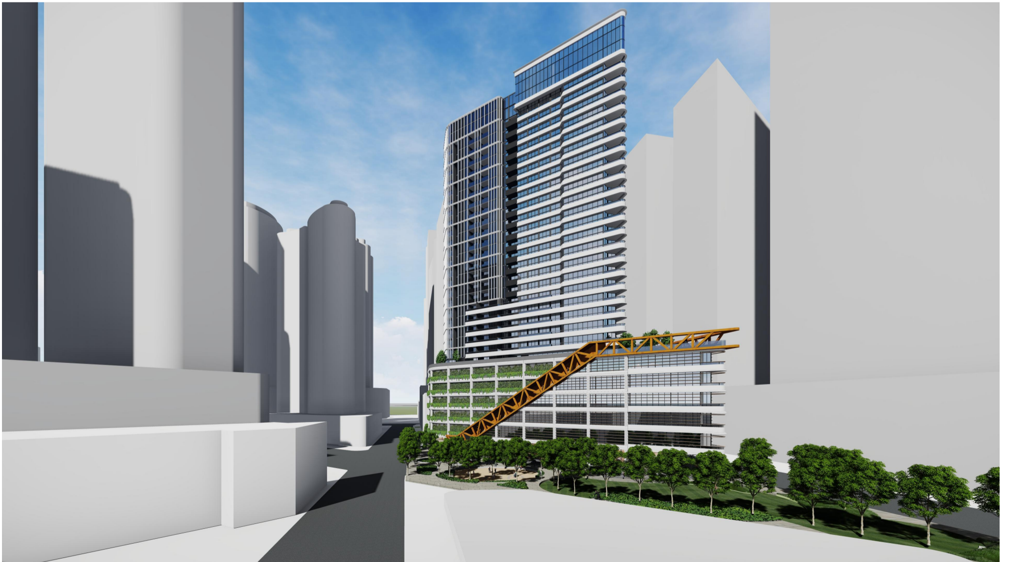
VIEW FROM MUNRO STREET