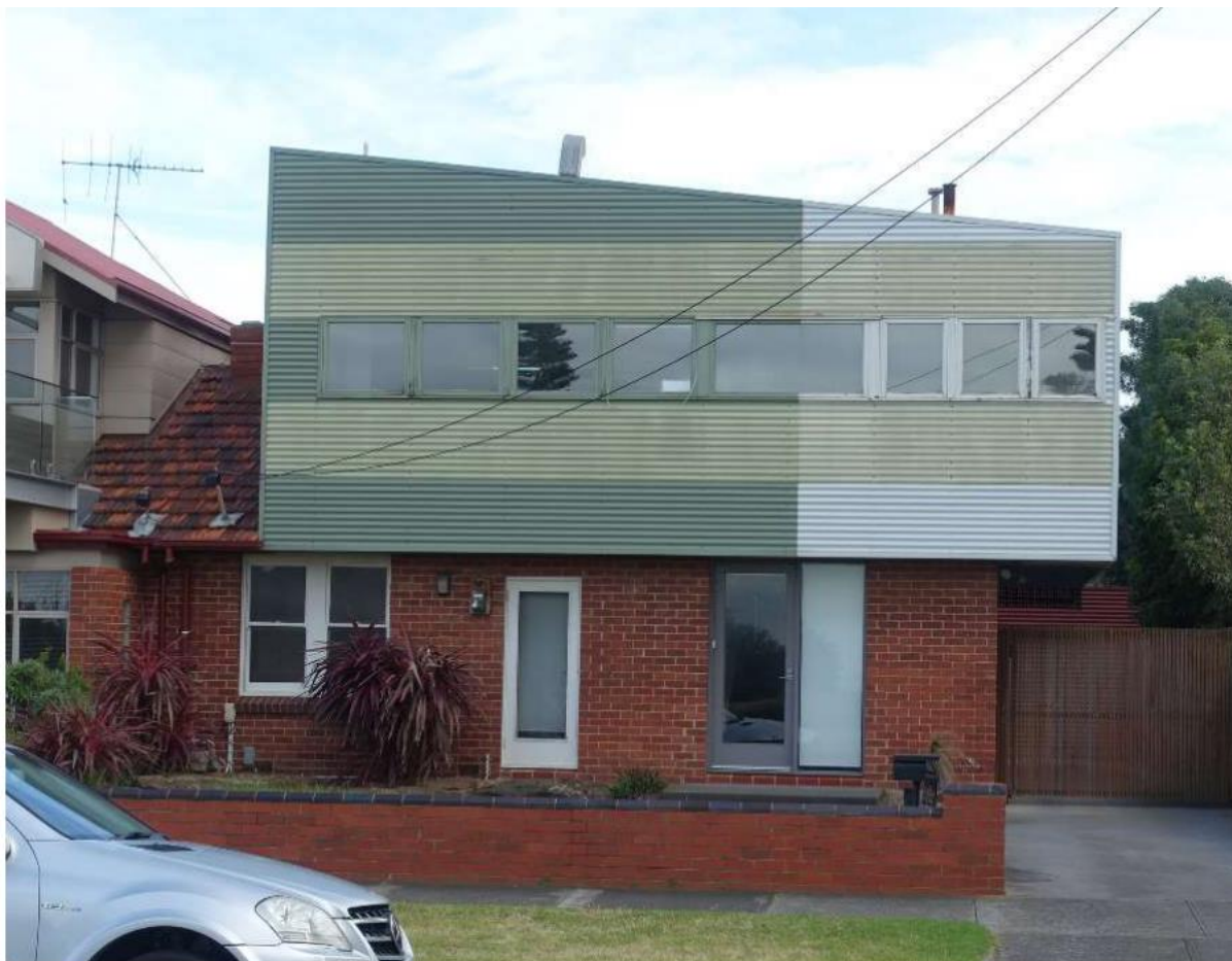
Figure 8 Streetscape photograph of 293 The Boulevard, Port Melbourne

The Amendment proposes to change the grading of this heritage property from Significant to Contributory within HO2.