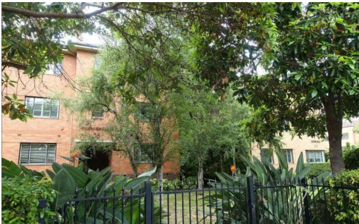
Figure 3 Streetscape photograph of part 58-60 Queens Road, Melbourne