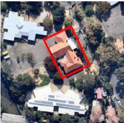
Figure 6 Panel preferred Heritage Overlay curtilage for the Elwood Primary School

The Panel’s view is influenced by the fact that a more tightly drawn polygon would capture those elements of the place that are significant, noting that the building has a well-defined curtilage. This is also a readily recognisable ‘boundary’. By contrast, a 10 metre curtilage, if applied, seems somewhat arbitrary, especially since it has not been demonstrated that the building is historically important as a standalone structure, rather than as part of a complex of school buildings.