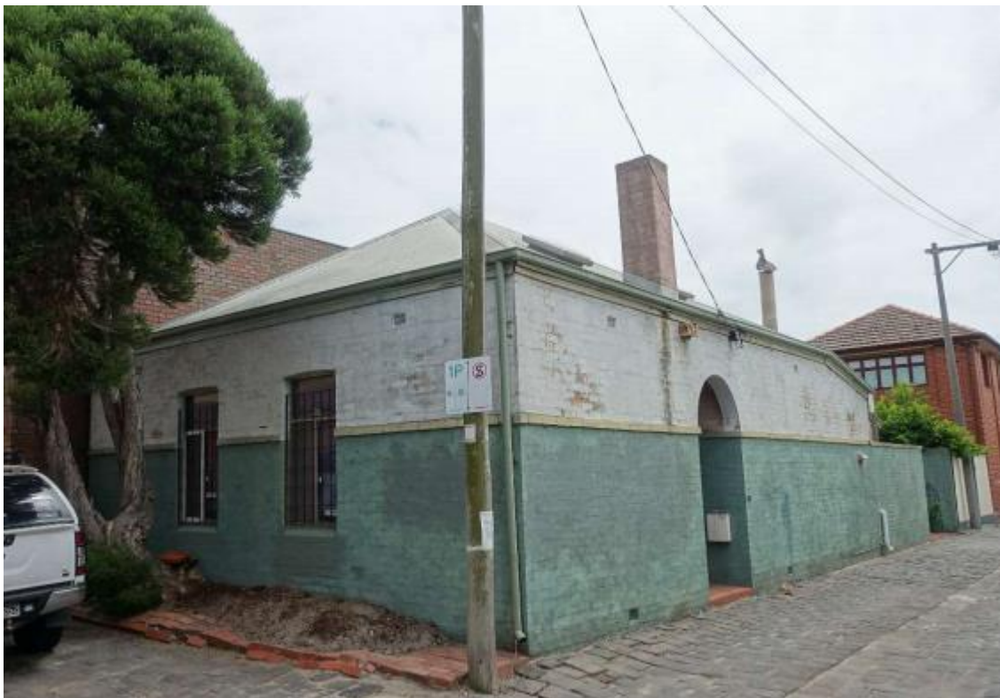
Figure 1 Streetscape photograph of 207 Little Page Street, Middle Park

The Amendment proposes to revise the grading of this property from Non-contributory to Significant in the HO444 Precinct (Middle Park and St Kilda West).