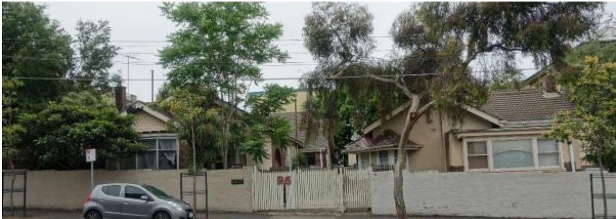
Figure 4 Streetscape photograph of 96 Grey Street, St Kilda

The new place Citation 2002 is provided below: