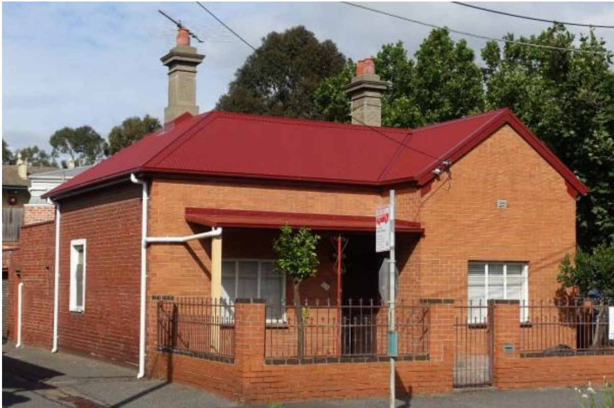
Figure 7 Streetscape photograph of 273 Bridge Street, Port Melbourne

Taking a comparative approach, Ms Schmeder considered this extent of original heritage fabric compared well to other similar period dwellings she observed in the precinct that were also graded Contributory.