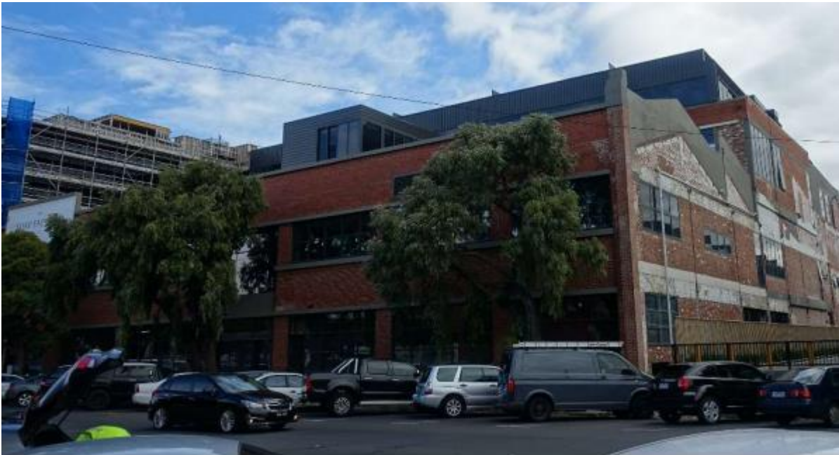
Figure 5 Streetscape photograph of 14 Woodruff Street, Port Melbourne

The Panel agrees that 14 Woodruff Street still retains sufficient physical and visual heritage evidence from the public realm and provides an important reminder of the large scale of the former industrial complex on the land. It notes that a similar approach was achieved with the State listed HV McKay Harvester Factory site in Sunshine (VHR H667).