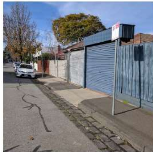
Looking east along Blanche Street