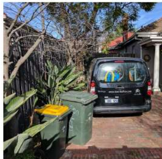
Looking along the Road within the occupation of 27 Blanche Street