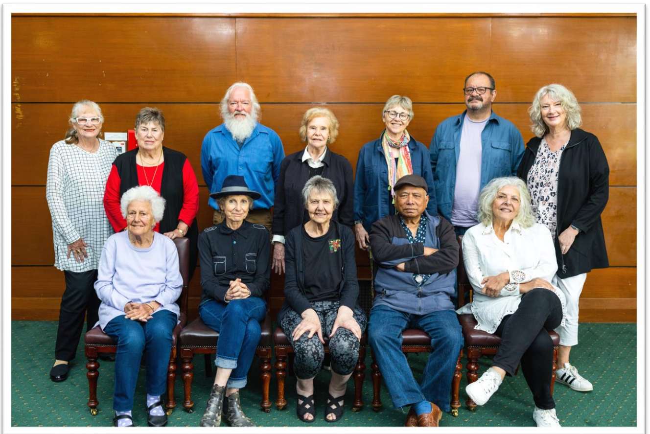
Pictured - OPAC members December 2022