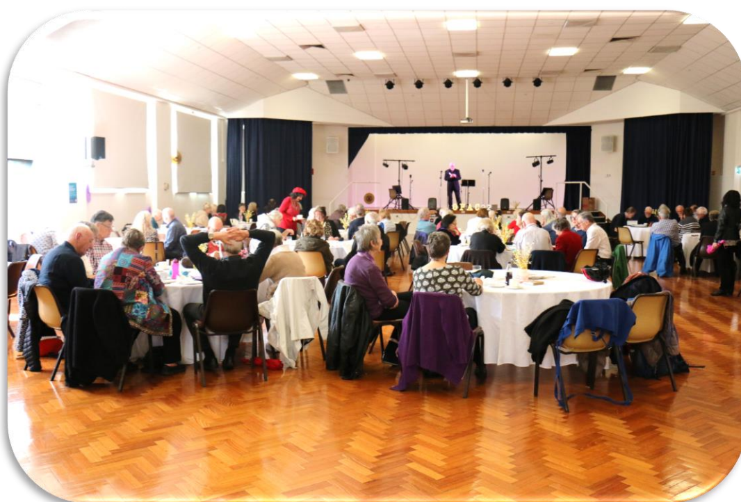
Pictured: Launch of the 2022 Seniors Festival and Celebration of 22 Years of the OPAC, Port Melbourne Town Hall, 7 October 2022.