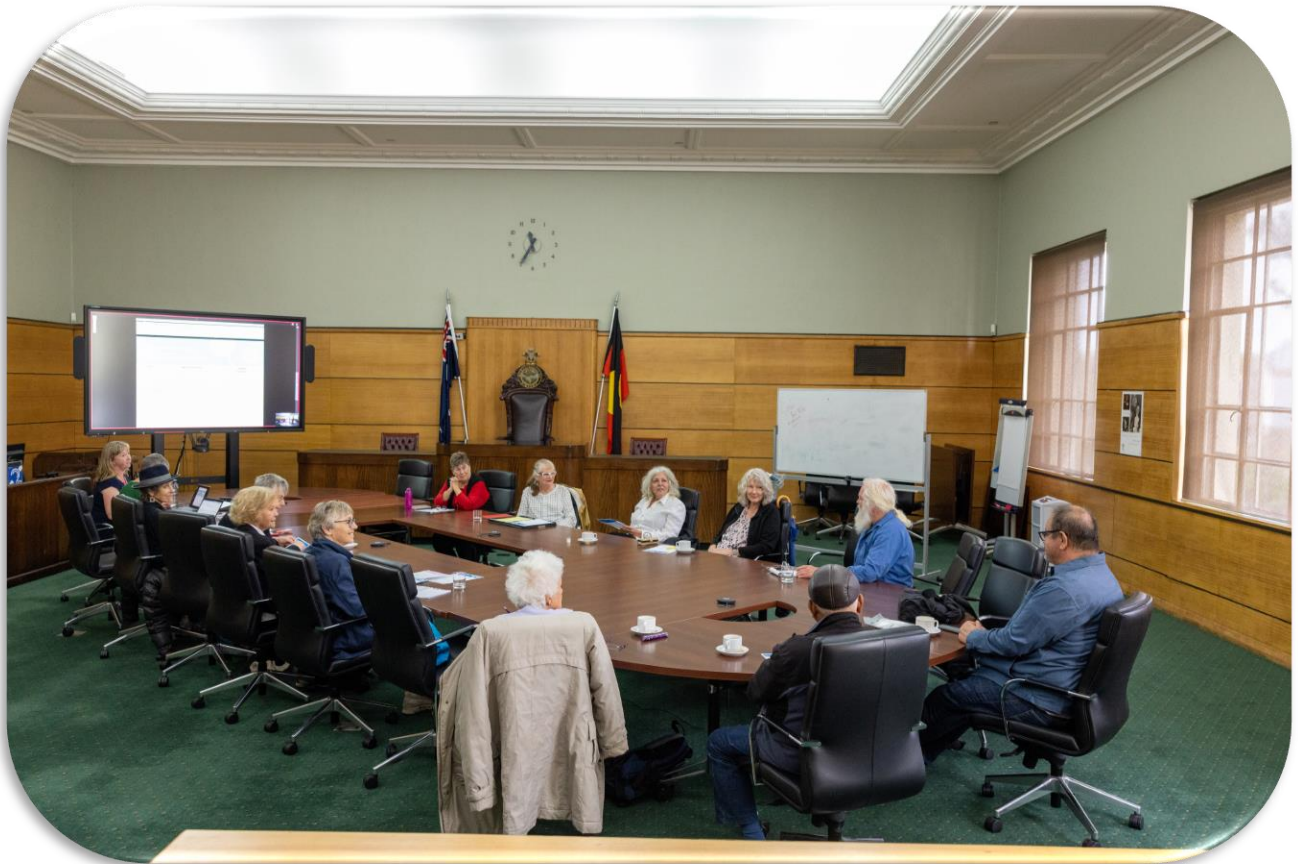
Pictured: OPAC Meeting December 2022.