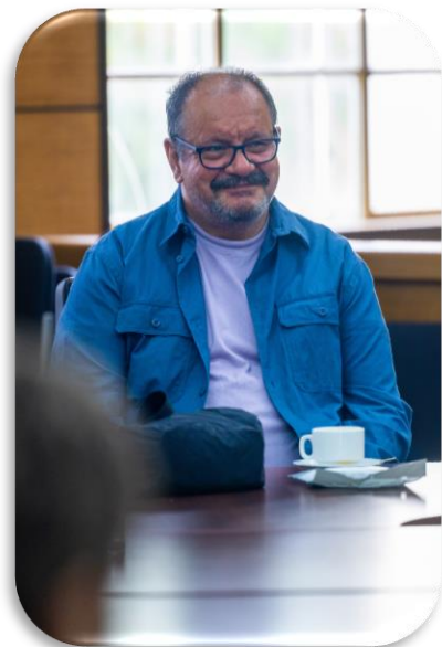
Pictured: OPAC Meeting December 2022.