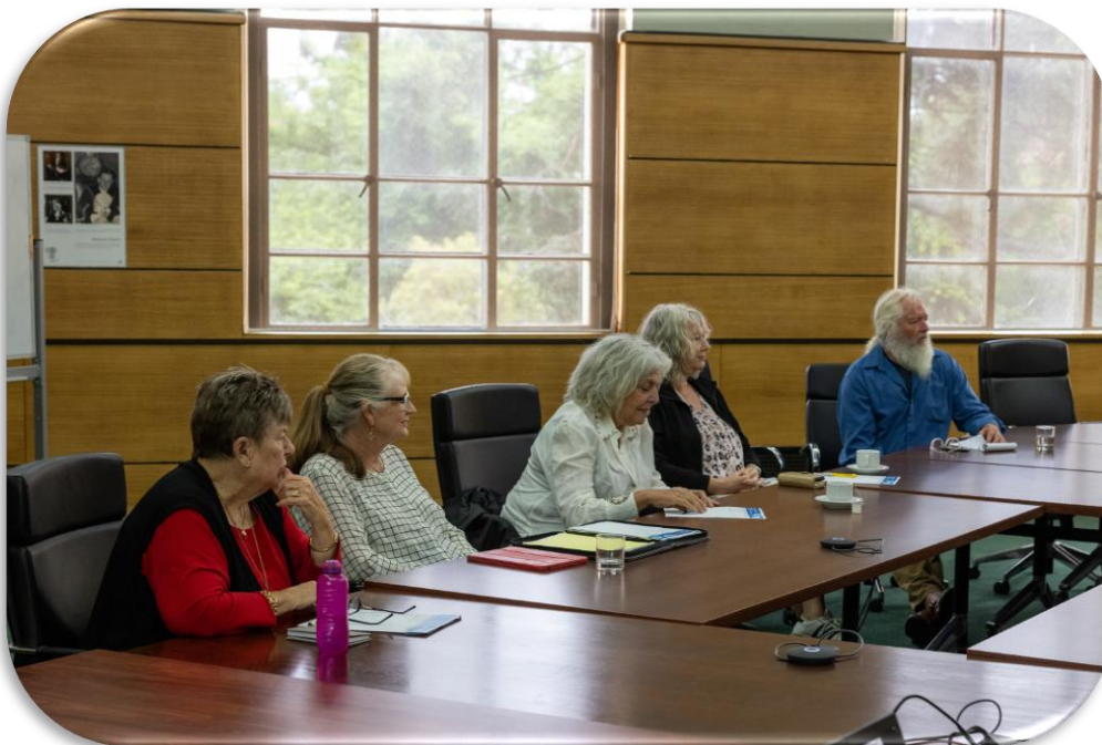
Pictured: OPAC Meeting December 2022.

As part of the consultative role of the OPAC, council officers regularly sought advice and feedback on council activities and initiatives relating to the needs, engagement, and inclusion of older people. In turn the OPAC brought to the meetings feedback and issues on council business that were raised by the community.