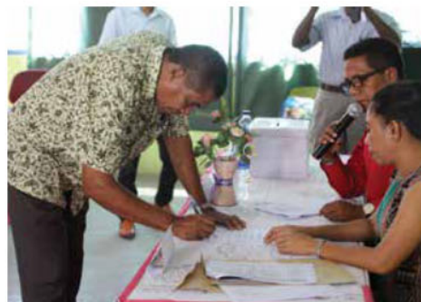
The District Administrator of Covalima attending the CCC AGM.