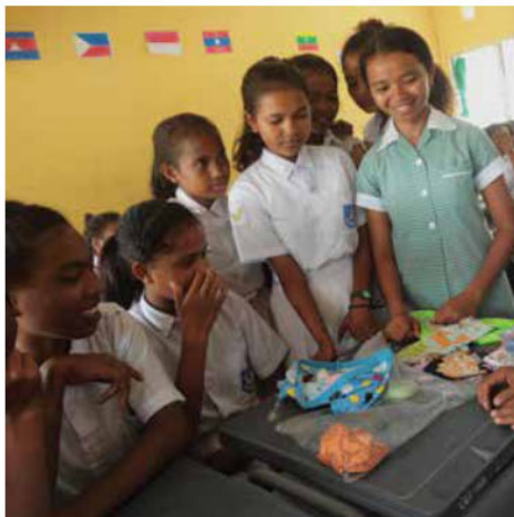
Students participating in health & hygiene training.

A new WASH Committee consisting of six teachers, one representative from the Parents Association and two community