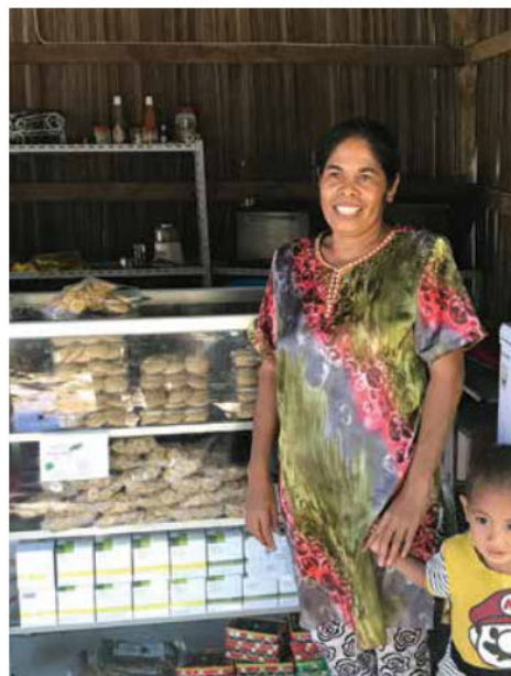
The Remajejeju group, established through the RWDP, have a very successful shop in Suai.

of women in leadership and the workplace, and the role of men in the home.