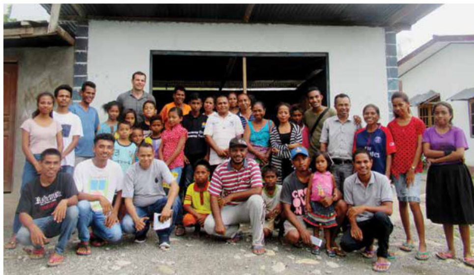
Community members in Ogues at a meeting to discuss computer training.

One scholarship recipient, studying at Marista Teachers College in Baucau, graduated in 2018 and is now working as a teacher at the local vocational training centre in Suai, and teaching current scholarship recipients in the hospitality and administration courses. Another graduate commenced work this year for the national organisation for people with disabilities, RHTO. Based in Suai, his role involves working in communities to encourage disability inclusion and also to share information on disaster risk reduction.