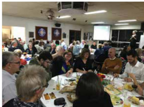
Over 70 people attended the trivia night.