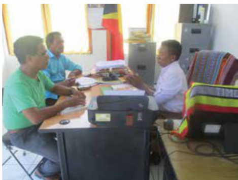
Rede Covalima staff meeting with Administrator in Suai Vila.

Through training workshops held in Dili, the CCC connected with Give2Asia, a US-based non-profit organisation. The CCC were successful in their application to Give2Asia to receive funding to implement a Disaster Risk Reduction ten-month trial program from July 2018 until May 2019. This was a successful program implemented in four rural villages in Covalima district involving more than 200 people. The CCC have reported on the program outcomes at a forum in Dili and have been strongly encouraged to apply for further funds to extend this program in 2020.