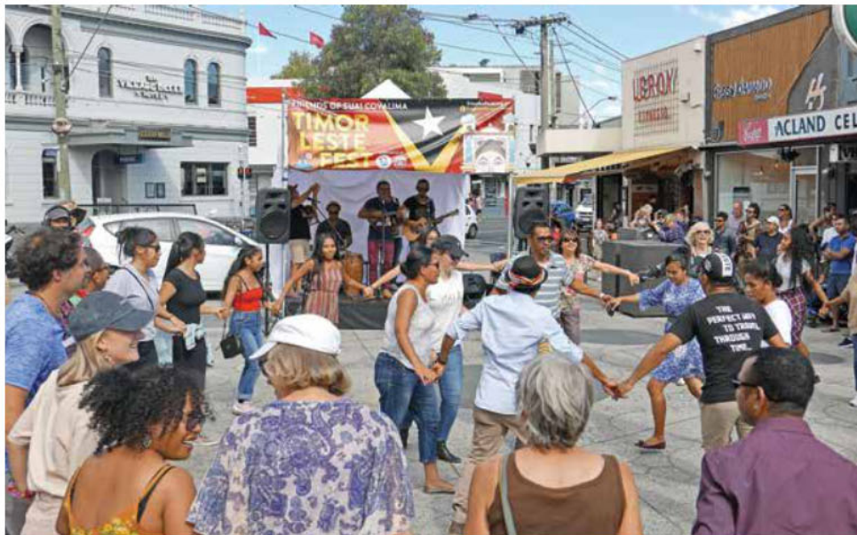
The crowd joining in the dancing at the Timor Leste festival in Acland Plaza.

Hundreds of people attended the festival and there was a wonderful atmosphere. It was great to see many new and old friends gathering together to enjoy the entertainment and to celebrate the friendship.