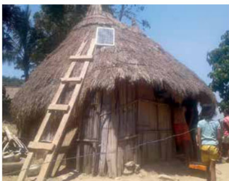
Solar installation in Halik Nai.

The CCC staff have played a key role in community consultation before and after