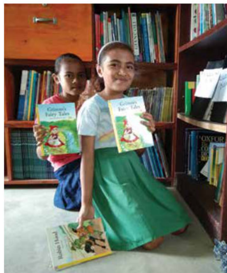
English language students at CCC reading books in the CCC library.

The workshop was held on 15-16 April, with 58 participants from pre-secondary and secondary schools throughout the district. The objective was to develop skills to implement practical activities to use alongside theory in the classroom. Trainers, teachers and students shared ideas to create fun learning experiences, often using everyday objects. The feedback from all who participated was that the workshops were extremely beneficial. FoSC will continue to provide support for initiatives from this enthusiastic group of local teachers.