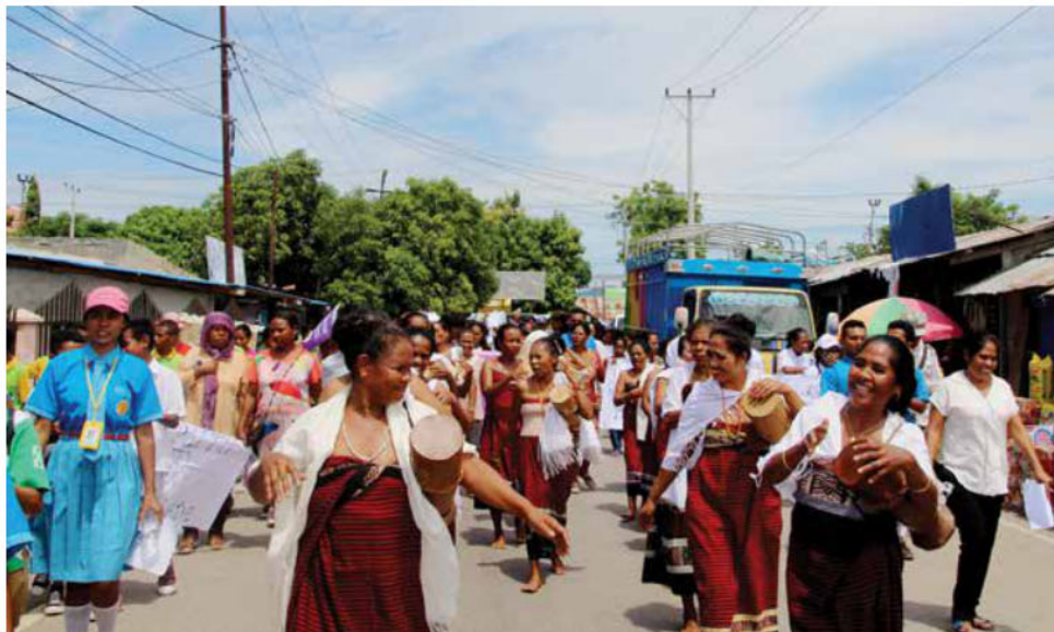
Women parading in the streets calling for equality.

(RHTO) to CCC staff. The training provided staff with a better understanding of how to work inclusively with people with disability, and to build disability awareness.