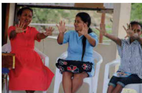
Community participating in Saving for Change training.

The CCC are working in partnership with Oxfam to deliver the rural livelihoods Haforsa program in four villages in Covalima. The program involves 14 farmer groups (including approx. 200 farmers) and aims to help rural communities to increase their food security and income. Activities include training in food production, crop diversification, livestock practices, water and land conservation, horticulture and agriculture. Staff also work to connect communities to local markets to increase their income.