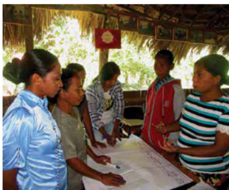
Women participating in a reflection workshop at the CCC.

speaking, conflict resolution and models of decision making. A further objective is to ensure that women understand gender equality and referral pathways for victims of family violence.