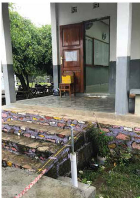
Taps have been installed in the front of all school buildings.