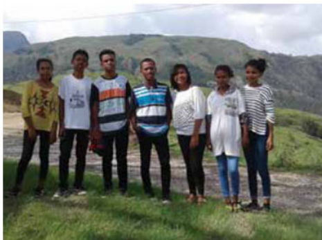
Students travelling to Maliana to sit entry tests.

Scholarships are funded through FoSC fundraising activities and community donations, and the application and