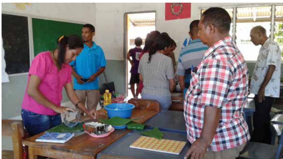
Science and mathematics teachers participate in a two-day training workshop.

Since 2010, over 1100 young people have completed English language training at the CCC. Trainers deliver three levels of English language training, and each level consists of 36 hours of training over six weeks. This year, 70 students have enrolled for English language training at