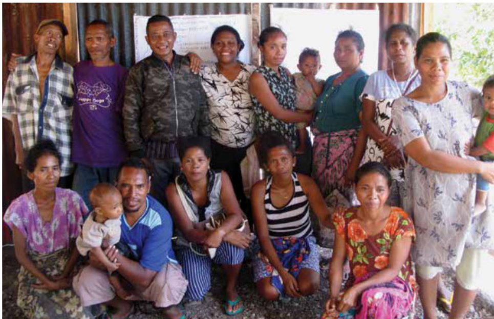
Communities receiving training for disaster risk reduction.

The network includes 12 member organisations, who meet quarterly and involve local government ministries and services in their meetings and training.