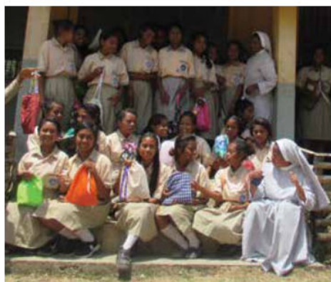
Students receiving sanitation kits.