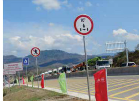
Section 1 of the new highway from Suai is now open.