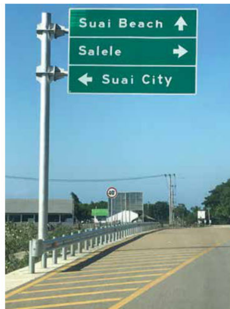
Signage on the open stretch of highway.

last 12 months. It has been announced that exploration will commence in the coming year however there is a lack of information on where this will occur and the impact on communities. The Rede Covalima Network is also monitoring this closely