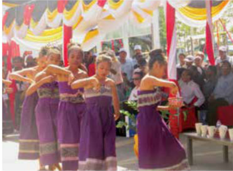
A traditional dance performance at the highway inauguration.