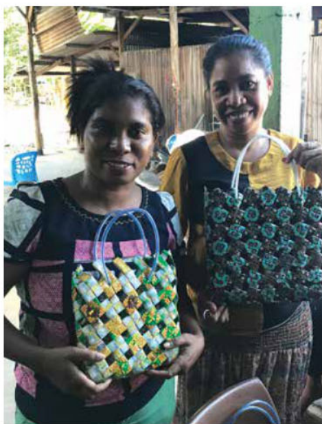
RWDP staff with bags produced by local women.

A key focus area for the CCC is to contribute to the empowerment of women; this includes support for economic activities and the encouragement of women's leadership and participation in political and civil life. It is recognised that the concept of gender equality challenges culture and tradition, and CCC staff are working hard to shift attitudes on the role