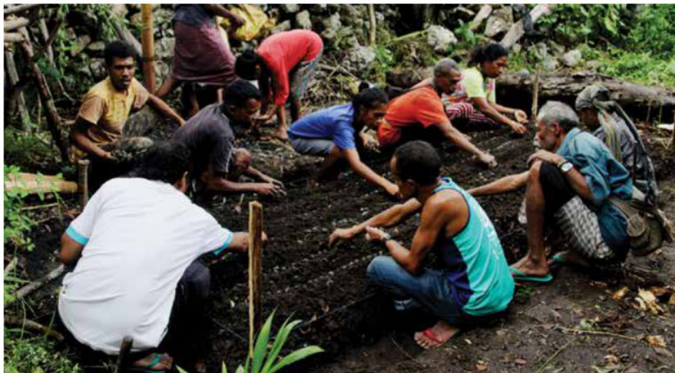
Working with rural farmers groups to improve farming practices.

education and training in agroforestry and permaculture.