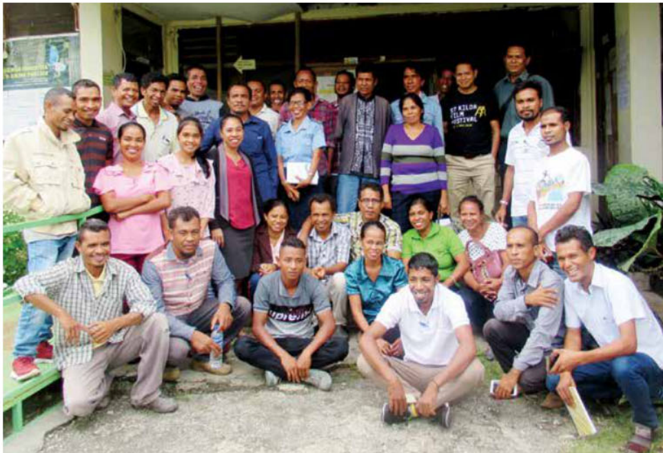
Commission members, staff and volunteers at the Covalima Community Centre.